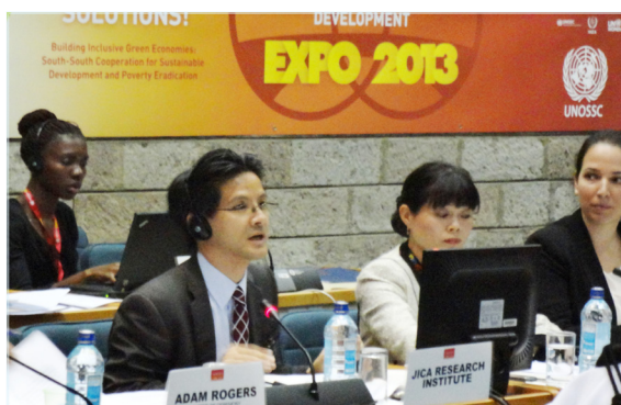
Honda Research Fellow (left in the first row)

JICA, through the GSSD Expo, demonstrated Japan’s presence in SSC and TrC as the effective approach to be incorporated into the post-2015 development agenda, while making an intellectual contribution towards the implementation of better SSC and TrC for the future.