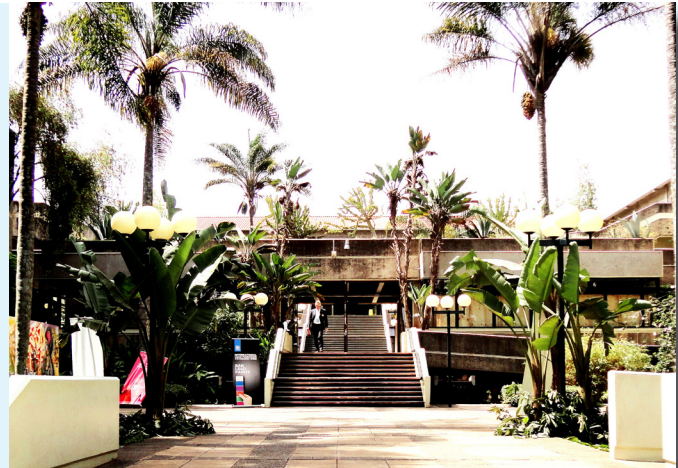
United Nations Office at Nairobi, Kenya