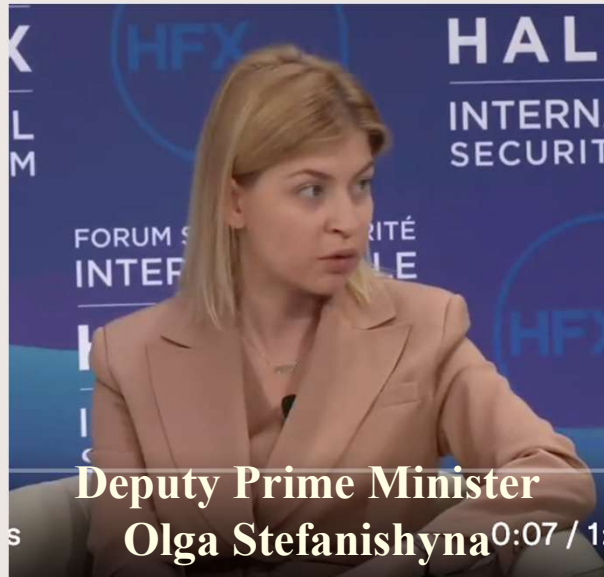
Deputy Prime Minister Olga Stefanishyna 0:07 / 1: