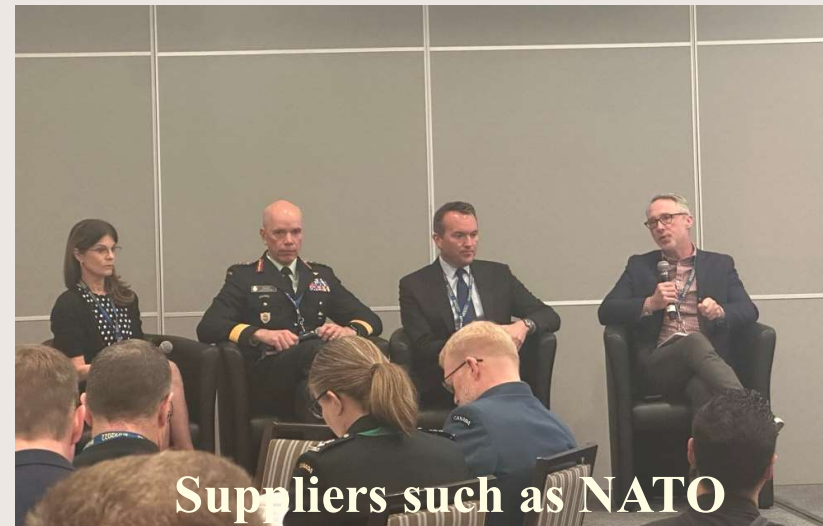
Suppliers such as NATO