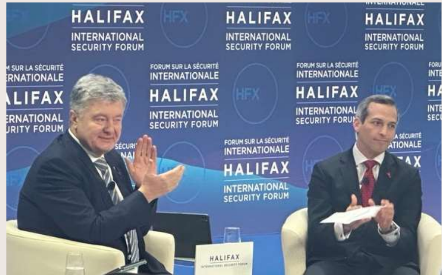
Former President Petro Poroshenko