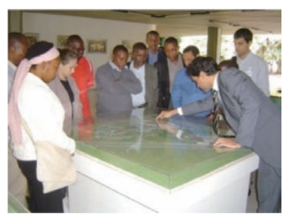
Trainees receiving lecture at IBAMA

technical support as JICA and INPE agreed to appoint technical support staff during the project implementation period until 2013.