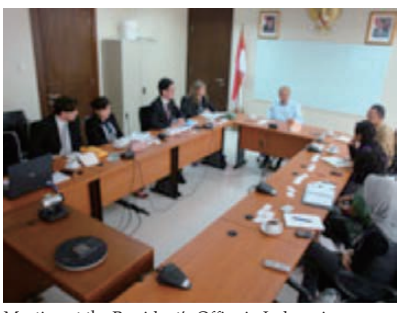
Meeting at the President's Office in Indonesia

Cooperation between Indonesia and Brazil progressed various the steps. Prior of the implementation "International Course on Rainforest Monitoring" for countries Southeast Asia, a Japan-Brazil joint missionwas dispatched Indonesia in July 2011 for the purpose of conducting a needs