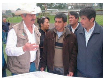
Technical visit to the Tula Irrigation District, Mexico, guided by Conaguas’s officer in chief

The activities completed in 2012 gave Conagua a detailed knowledge of the Bolivian water sector and the status quo of wastewater treatment and water reuse, as well as of the institutional framework in Bolivia. Furthermore, Bolivia developed a clear idea of Mexican technological and administrative progress, and institutional, organizational, and administrative advances in the water sector, especially in the field of wastewater treatment and reuse.