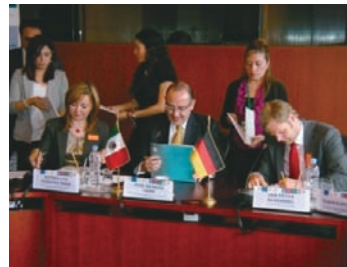
Sign of the Record of Discussions by the representatives of AMEXCID, Conagua and GIZ-Mexico.

The technical and financial responsibilities of each partner are defined in the “Record of Discussions” (Registro de Discusiones). Mexico strongly fostered the ratification of the paper to have a clear framework for each partner’s contribution within project activities.