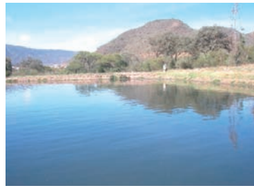
Rehabilitated wastewater treatment ponds in the Municipality of Comarapa, Bolivia

It should be pointed out that five Municipalities in Bolivia received technical advice by Mexican experts for the improvement and rehabilitation of existing wastewater treatment plants. In the municipality of Comarapa the recommendations of the Mexican experts were successfully implemented and led to the rehabilitation of the municipal water treatment plant.