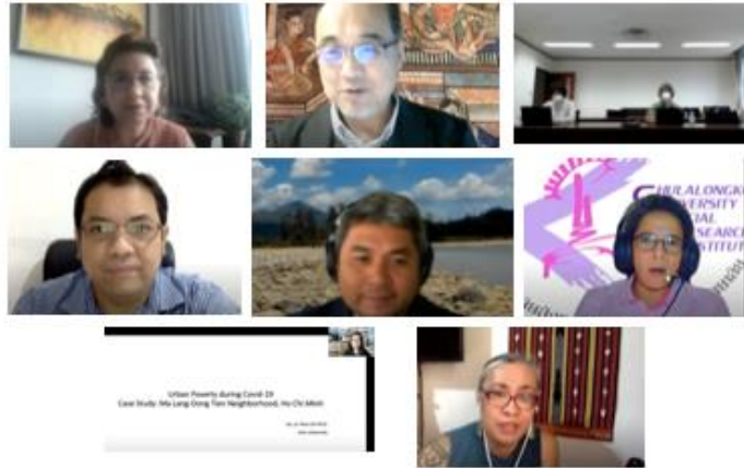
The second authors' workshop participants, including the project advisors, researchers, and the JICA Ogata RI project team, joined from Singapore, Thailand, Indonesia, Australia, Philippines, and Japan. (From Zoom, April 17, 2021)

The 3 rd Authors' Workshop was the presentation of research plans for the next level of the project, examining empowerment practices, particularly in response to the pandemic, and further analysis of the concept of empowerment in relation to Human Security. As the research project moves to its Level 2 analysis, the researchers are tasked to pay attention to the "empowerment" of the target groups with specific human security issue/s that are related to the SDG agenda. Advisors pointed out that examining the concept of empowerment from different perspectives, voices, and layers provides the more unique and interesting value of this project. It intends to look at engagement between individuals, groups, and communities to understand how they were empowered rooted in their experiences. A focused group discussion with a combination of online and offline data gathering is a valuable method to realize empowerment in collective action.