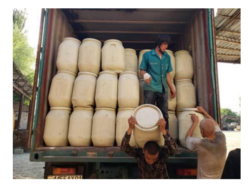
Figure 1: Tons of Chlorine procured by JICA as Support to Tajikistan in the Response Phase

For example, as reported by Curtis and Cairncross (2003), handwashing with soap and water can reduce diarrheal diseases by 47 percent, one of the main objectives of the Water, Sanitation and Hygiene (WASH) is to "improve public health and ensure healthy living conditions." Therefore, building on understanding WASH's fundamental of contribution to people's health, it is essential to examine measures to prevent the spread of COVID-19, especially with vulnerable groups, and to strengthen the response in terms of WASH. Furthermore, there is a need to identify countermeasures for water utilities that are severely affected and promptly implement them.