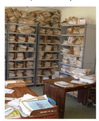
August, 2007 Before the start of 5S practice

(The case of Mbeya Referral Hospital in Tanzania)