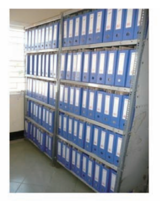
August, 2008 One year after the 5S launch