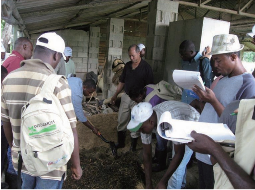
Figure 2. Practice of Production of Compost in the Dominican Republic