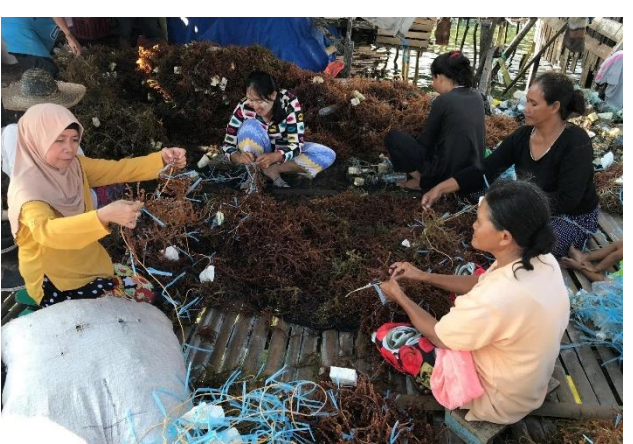
Typical seaweed farming family in the project on Comprehensive Capacity Development Project in Mindanao

guidance in agriculture by experts of the International Rice Research Institute and government agricultural extension officers was made possible in the area controlled by the Moro–Islamic Liberation Front (MILF), where government officials were previously unable to enter. This type of assistance developed the capacity of people in Mindanao and helped its residents enjoy the dividends of peace.