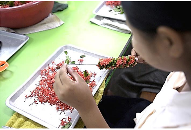
Training in the project on Strengthening MDT for Protection of Trafficked Persons in Thailand

of linkages among organizations in Thailand and neighboring countries and to make Thai and foreign victims smoothly transferred to their own countries and socially reintegrated. Participants of the workshops came from multiple stakeholders and shared experiences and challenges in each country. They also prepared a handbook for on—site personnel to assist the victims' repatriation.