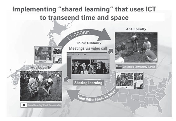
Figure 7-3: Japan-U.S. environmental education project (Master Teachers Program)