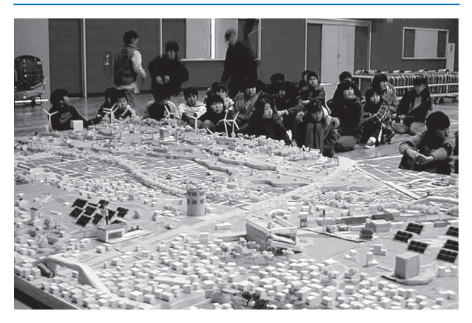
Figure 7-1: 6th grade Future City project at Omose Elementary School

Based on the experience of Omose Elementary School, ESD education spread to other schools in Kesennuma, with each school pursuing its own ESD activities. Furthermore, around 2008, all elementary and junior high schools in the city, as well as some of its kindergartens and prefectural high schools, became UNESCO Schools, which are also designated by the Ministry of Education, Culture, Sports, Science and Technology (MEXT) as "ESD Promotion Centers." It was here that the first system in which local kindergartens and elementary, junior high, and high schools collaborated to implement ESD throughout the educational system was established. This subsequently developed into a model for ESD, not only for Japan but also for the world.