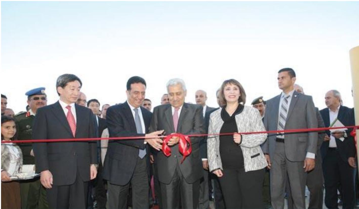
H.E Prime Minister Dr. Abdullah Nsoor Inaugurating The Ceremony