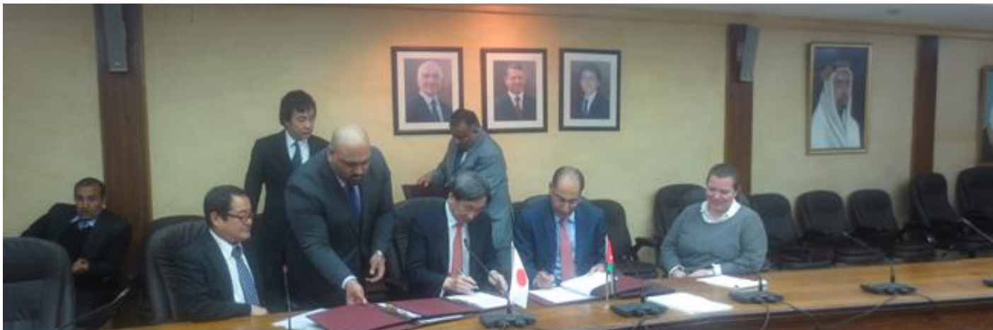
Signing Ceremony of the Grant Agreement and the Exchange of Notes at MOPIC

with the JICA on January 9, 2014 to conduct a comprehensive program to respond to the urgent needs of the sector, the objective of the Program is to assess the effect of the Syrian Refugees on water supply and wastewater services in the host communities.