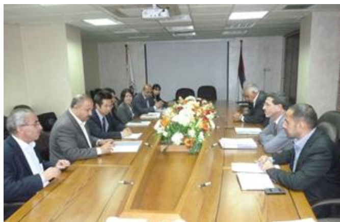
JICA Mission-WAJ Discussion on Project

The rapid rise in the number of Syrian refugees since the beginning of the crisis in March 2011 caused a huge challenge on water sector including a severe stress on public water supply systems and wastewater services. More than 600 thousands registered refugees were located in the northern part of the kingdom have put more pressure on the already limited water resources of Jordan. This requires international support and response. Accordingly, the Water Authority signed the Minutes of Discussions