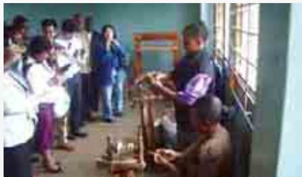
Members of Nanyuki Weavers & Spinners demonstrate how to make yarn from wool.

The OVOP program supported by JICA has provided training for the society's members, for use in value addition. A follow-up after the workshop revealed that the group had begun processing