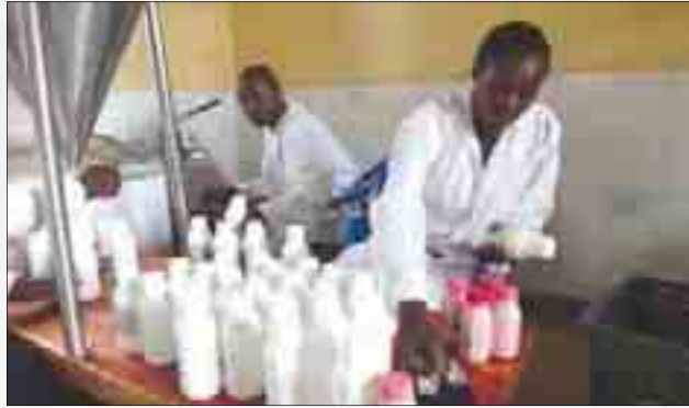
Yoghurt processed and packaged at the Watuka Farmers Cooperative Society.

It was under this mandate that the OVOP Program