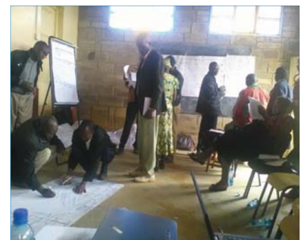
Market Survey training for staff and farmer representatives in Kuresoi North sub-county, Nakuru

*SHEP: Smallholder Horticulture Empowerment and Promotion