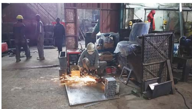
Kenya Coach Industries (KCI)

Industrial development, especially SMEs, is one of priority area for JICA's economic sector in Kenya. JICA has been implementing "Project on Industrial Human Resource Development for Industrial Development" in conjunction with Kenya Institute of Business Training (KIBT). The objective of the project is to enhance productivity and competitiveness of SMEs through the improvement of business management process (KAIZEN, 5S, Marketing and Sales and Financial management). The Project has so far yielded positive results especially with regards to the provision of consultation service to SMEs by KIBT and related institutions. Further, JICA collaborates with Toyota Kenya Academy for the provision of Japanese quality training course in the field of construction and agriculture machinery.