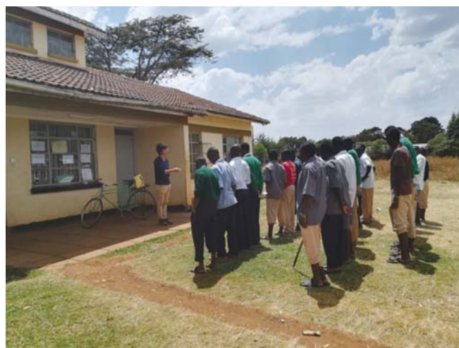
Boy's Probation Hostel

Child protection activities are one of the main areas in which the JICA Volunteers are recruited to work in. Volunteers are dispatched in institutions that deal with child protection, probation and after cares services, such as rehabilitation schools, children remand homes, probation schools and more. In these institutions, they work closely with the staffs in the institutions as well as with the children in conflict with the law or children in need of care and protection. The volunteers engage the children and youth to activities such as physical education to get to know how to respect the law and health benefits. They also engage the youth in activities to encourage them to improve their economic status by starting up small scale businesses helping in rehabilitation.