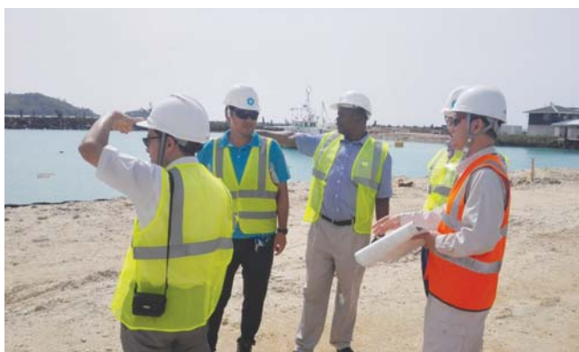
Technical Survey of Construction Site on the Expansion of Fish Port in Seychelles

As the second most important sector in Seychelles, fisheries sector contributes 20% of GDP and employs 17% of the population. JICA has been supporting development of artisanal fishing through construction of fish landing facilities and installation of storage equipment in collaboration with Seychelles Fishing Authority (SFA). The ongoing Grant Aid Project for Construction of Artisanal Fisheries Facilities in Mahe Island (Phase 2) is planned to expand the industry by catering for more and larger fishing vessels. JICA has also continuously supported capacity development of Seychelles government staff through training in Japan. In October, ex-trainees formed an alumni association.