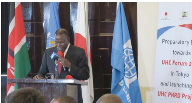
Dr. Cleopa Mailu, Cabinet Secretary, Ministry of Health, at the event

In November 2017, a preparatory event towards the UHC Forum 2017, held in Tokyo in December 2017, was organized in Nairobi. Key note speakers included the Japanese Ambassador to Kenya, and the Cabinet Secretary for Health. Government of Kenya expressed its commitment to accelerate health system reform for attainment of UHC.