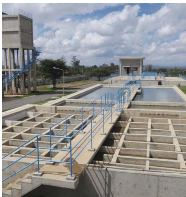
Narok Water Treatment Plant

The provision of safe water contributes for Kenya's attainment of vision 2030 and global issues and challenges on Pillar 3 of Nairobi Declaration.