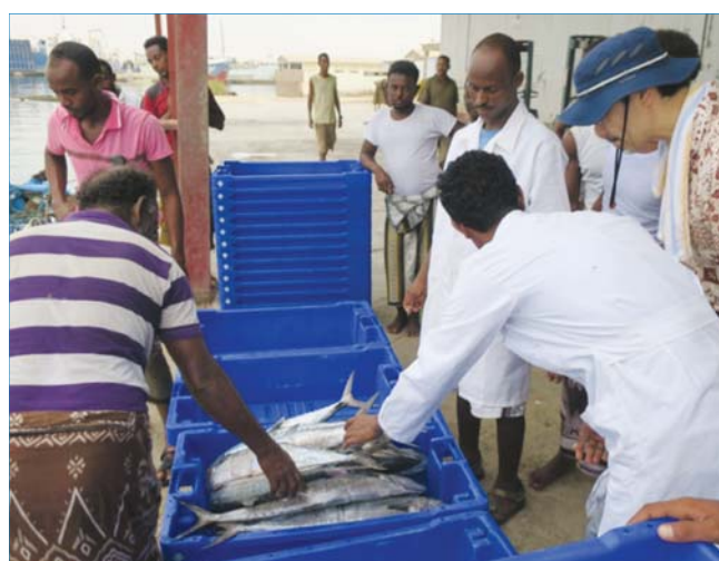
Training in Data Collection Survey at Massawa

The Data Collection Survey on the stock assessment of marine resources was held in July and November 2017 in Massawa, Eritrea. The participants from Ministry of Marine Resource learned method to assess and periodically monitor the stock of marine resources by utilizing CPUE (Catch Per Unit Effort) method.