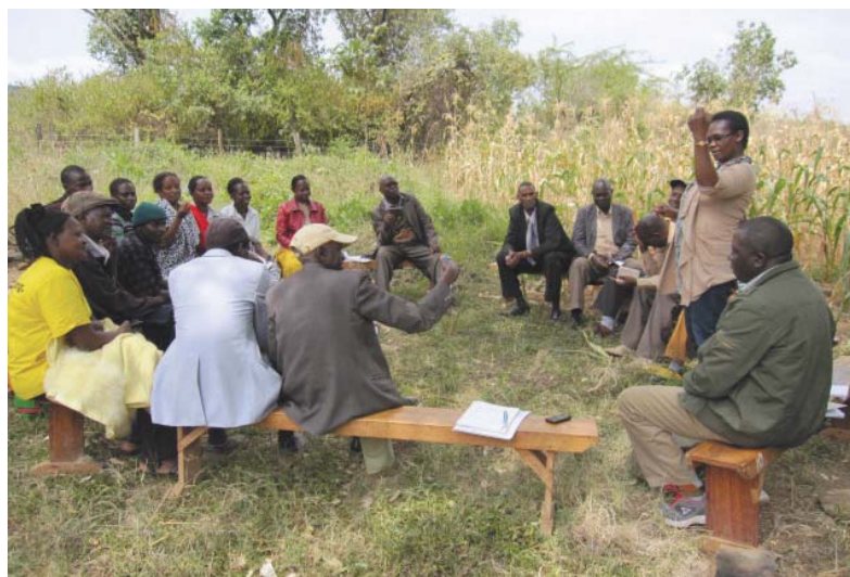
Forestry Farmers' Field School

This project consists of five components, one of which is Pilot Implementation of forestry activities. Under this component, Kenya Forest Service (KFS) is running Farmer Field Schools to familiarize sustainable forest management to farmers.