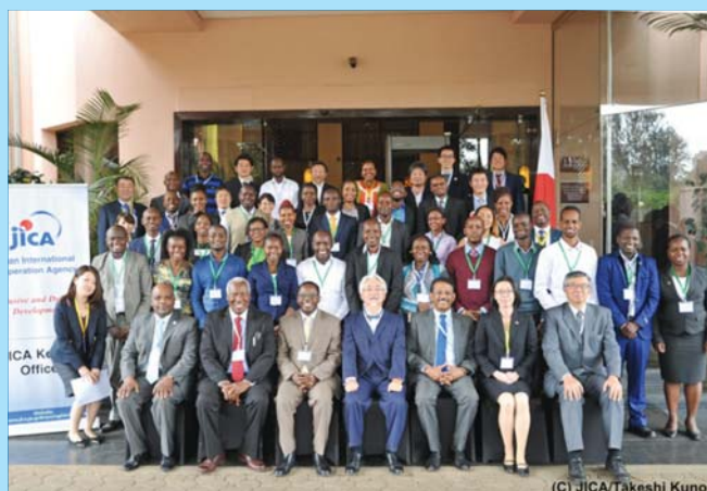
ABE 4 th Batch Send-Off Ceremony

And now, this is also the time to encourage the returnees to contribute the aim of ABE as a bridge between two countries in various ways. JICA Kenya will closely follow them up to strengthen our linkage.