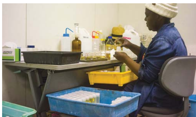
Preparing samples for her research at JKUAT

"African Union - african innovation - JKUAT And PAUSTI Network Project" is a joint initiative involving Jomo Kenyatta University of Agriculture & Technology (JKUAT), Pan African University - Institute of Basic Sciences, Technology and Innovation (PAUSTI) which was established by African Union Commission (AUC), and JICA to strengthen the knowledge and skills in the fields of Agriculture, Engineering, Science and Biotechnology of both PAUSTI and JKUAT students and staff. After the project started in 2014, next generations of scientists who obtain a PhD in Japan or strengthened in JKUAT and alumni from JKUAT/PAUSTI begin to contribute to the Africa's development using their knowledge and skills acquired through this project.