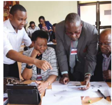
'AHLMN members pre-testing the eLearning LMG-HSS course'

Partnership for Health System Strengthening in Sub-Saharan Africa (PHSSA) Phase 2 focuses on virtual delivery of the leadership, management and governance (LMG) for health systems strengthening (HSS) training. This is with the aim of scaling up training to attain a critical mass of human resources for health (HRH) towards the achievement of universal health coverage (UHC) now being embraced by most countries in Africa and globally. In February 2018, a workshop was held in Nairobi, Kenya to pre-test the e-learning LMG-HSS materials and platform. The e-LMG-HSS roll out is targeting 3 countries in the JFY 2017 and up to 30 countries within the life span of the project.