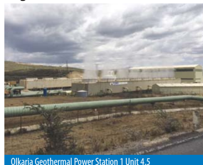
Olkaria Geothermal Power Station 1 Unit 4,5

JICA will be a strong contributor for Kenya's stable power supply continuously through development and strengthening of the power plant, transmission line and technical capacity of the engineers.