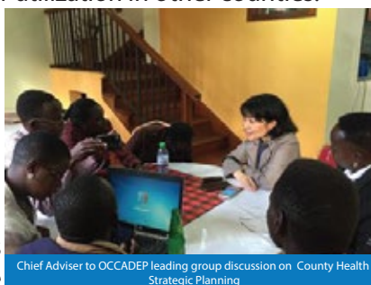
Chief Adviser to OCCADEP leading group discussion on County Health Strategic Planning

The Project further supported the Counties in health strategic and annual work planning, performance reviews and held forums for the counties to share their innovative