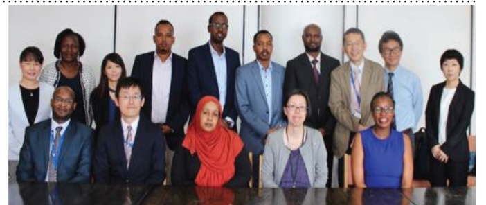
Project team spearheading the YEPS project.