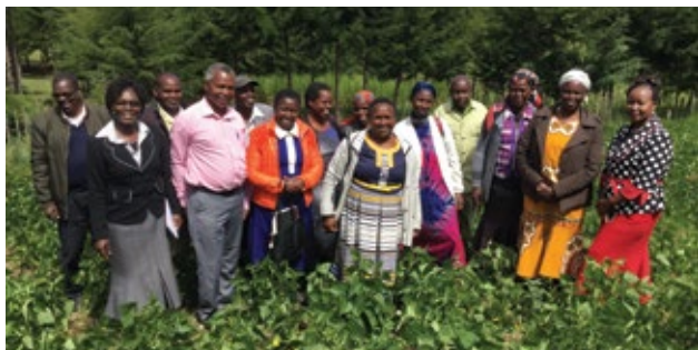
“Members of a farmers’ group using SHEP Approach show their farm”