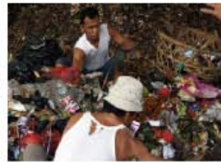
● Central Jakarta