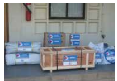
Emergency relief supplies

In case of the occurrence of a large-scale disaster, JICA dispatches Japan Disaster Relief Teams in response to requests from the governments of affected Countries. JICA also provides shipments of emergency relief supplies such as blankets, tents and medicines.