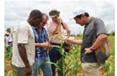
Technical Assistance by JICA Expert

For human resources development and formulation of administrative systems and master plans, technical cooperation involves dispatch of experts, provision of necessary equipment and training of Mozambican personnel in Japan and other countries such as Brazil. Projects can be tailored to address a broad range of issues.