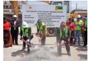
Nacala Port Rehabilitation

ODA loans support developing countries by providing low-interest, long-term and concessional funds (in Japanese yen) to finance their development projects. ODA loans are mainly used for large-scale infrastructure development projects.