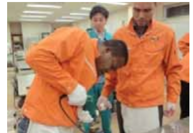
EDM staff training in JAPAN.

Training program in Japan provides opportunities to have an insight into the latest technology, as well as to learn policies and systems which Japan developed through its history. JICA offers more than 60 opportunities annually for Mozambique, ranged from agriculture, health and environment to combating corruption and rural development.