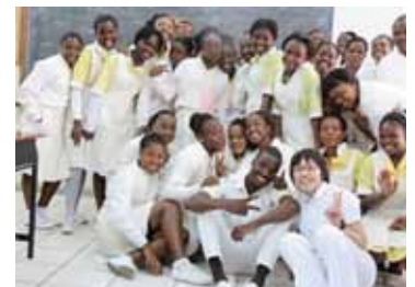
JOCV at Health Sciences Institution of Maputo

JICA dispatches Japan Overseas Cooperation Volunteers (JOCV) and Senior Volunteers (SV) in the field of education, health, agriculture, and so on. Through these activities, participating volunteers do not only contribute to the development of partner countries but also gain valuable experience in terms of international good will, mutual understanding and an expansion in their international perspectives.