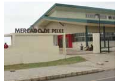
New Maputo Fish Market

Grant aid is the provision of funds without the obligation of repayment. Grant aid is used for improving basic infrastructure such as schools, hospitals, water-supply facilities and roads, along with provision of necessary equipment.