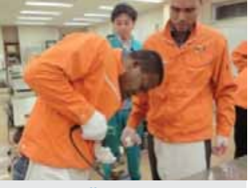
EDM staff training in JAPAN.

Training program in Japan provides opportunities to have an insight into the latest technology, as well as to learn policies and systems which Japan developed through its history. JICA offers more than 60 opportunities annually for Mozambique, ranged from agriculture, health and environment to combating corruption and rural development.