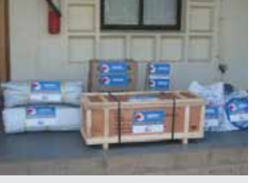
Emergency relief supplies

In case of the occurrence of a large-scale disaster, JICA dispatches Japan Disaster Relief Teams in response to requests from the governments of affected Countries. JICA also provides shipments of emergency relief supplies such as blankets, tents and medicines.