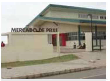
New Maputo Fish Market

Grant aid is the provision of funds without the obligation of repayment. Grant aid is used for improving basic infrastructure such as schools, hospitals, water-supply facilities and roads, along with provision of necessary equipment.