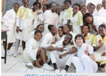
JOCV at Health Sciences Institution of Maputo

Through these activities, participating volunteers do not only contribute to the development of partner countries but also gain valuable experience in terms of international good will, mutual understanding and an expansion in their international perspectives.