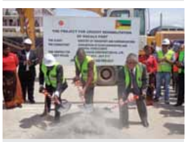
Nacala Port Rehabilitation

ODA loans are mainly used for large-scale infrastructure development projects.