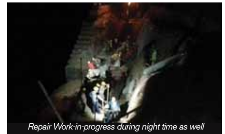
Repair Work-in-progress during night time as well