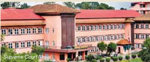
Supreme Court Nepal

With the Technical Assistance from Japan International Cooperation Agency (JICA) Supreme Court of Nepal is implementing "The Project for Strengthening the Capacity of Court for Expeditious and Reliable Dispute Settlement" from Sept. 2013 to March 2018. The project's objective is to establish the foundation to improve the court's function for promoting expeditious and reliable dispute settlement.