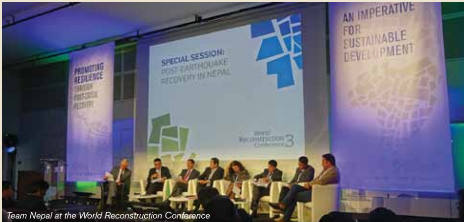
Team Nepal at the World Reconstruction Conference

The 3rd edition of the World Reconstruction Conference (6-8 June 2017) was held in Brussels, Belgium to promote resilience through post-crisis recovery.