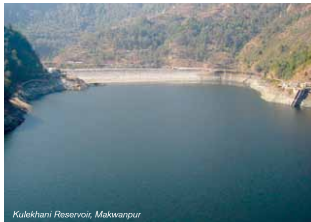
Kulekhani Reservoir, Makwanpur

The Kulekhani cascade project is the country's only reservoir based power station of 60MW (Kulekhani I) and 32 MW (Kulekhani II) that supplies reliable peak power in an integrated power system during the dry season by utilizing the seasonally regulated water in Kulekhani reservoir.