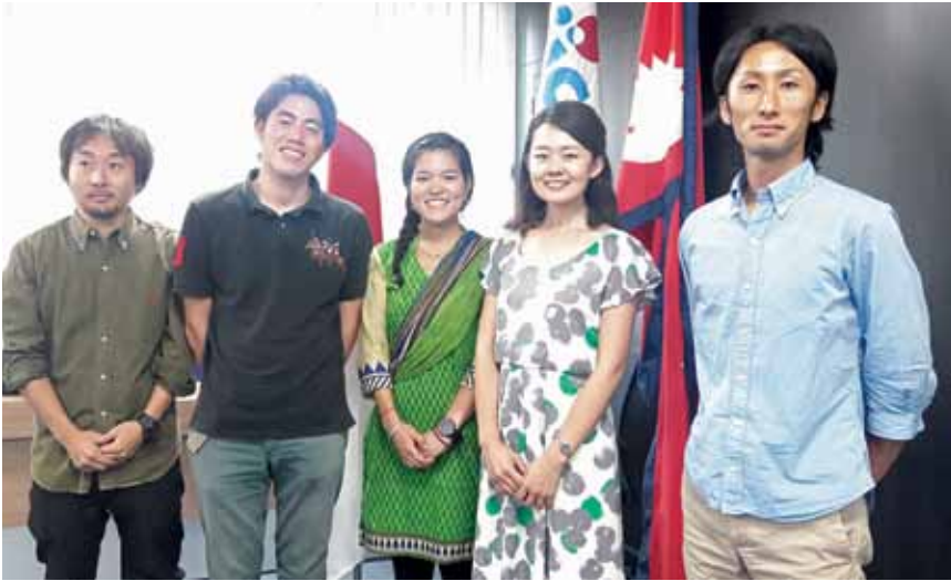
Parting Volunteers during their final presentation in JICA Nepal Office.

Japan Overseas Cooperation Volunteers (JOCV) program was founded in 1965 as part of JICA's grass root level technical cooperation. The major objectives of the program are to contribute to the socioeconomic development of the recipient countries. JOCV program in Nepal started in 1970 and so far more than 1,300 volunteers have been assigned to various fields across the country. JICA volunteers spend 2 years in Nepal adapting themselves to the local life, by speaking local languages, eating local food, and working together with the local counterparts. Therefore volunteer program at large have promoted cultural exchanges and mutual understanding between the two countries.