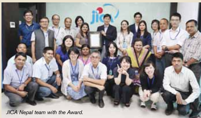
JICA Nepal team with the Award.

JICA Nepal office received the award for PR Grand Prix 2017 from JICA Headquarter. The award was presented to Nepal office in the category of outstanding event management for two of its major activity-1st Earthquake Anniversary Commemoration Seminar 2016 and Volunteer Activity Observation & Study Tour 2016.