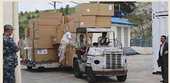
Emergency Relief Materials arrives at the Humanitarian Staging Area - Tribhuvan International Airport

The Government of Japan sincerely hopes that these goods will be delivered promptly to the victims and will somehow help in improving the lives of those affected and that restoration work will go ahead steadily in the disaster-affected areas and the victims will be able to go back to their normal and peaceful lives as quickly as possible.