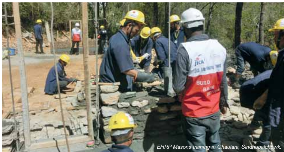
EHRP Masons training in Chautara, Sindhupalchowk.

(i) Meeting those financial requirements needed to reconstruct and