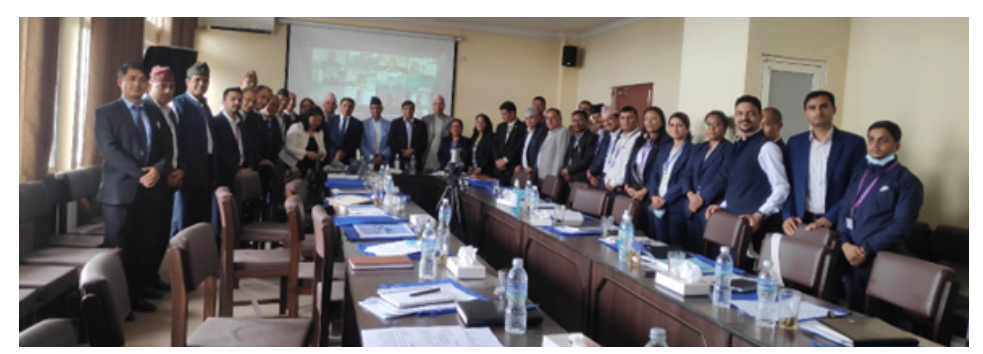
Participants comprising of judges, lawyers, government attorneys, ministry of law, Nepal law commission, legal institutions and officials from JICA during the seminar.

It has been almost 5 years that the new codes on civil and criminal laws were passed by the parliament. Supplementing to the glorious history of Muluki Ain, Muluki Civil Code and Muluki Criminal Code along with Civil and Criminal Procedure Codes and Sentencing and Execution Act has changed the paradigm of Nepalese legal system by addressing various new issues in addition to the current prevailing laws. In its 4 years of implementation, various discussions have been carried out on the daily use of the codes and its further development. Laws are dynamic and it keeps on growing according to the needs of society;