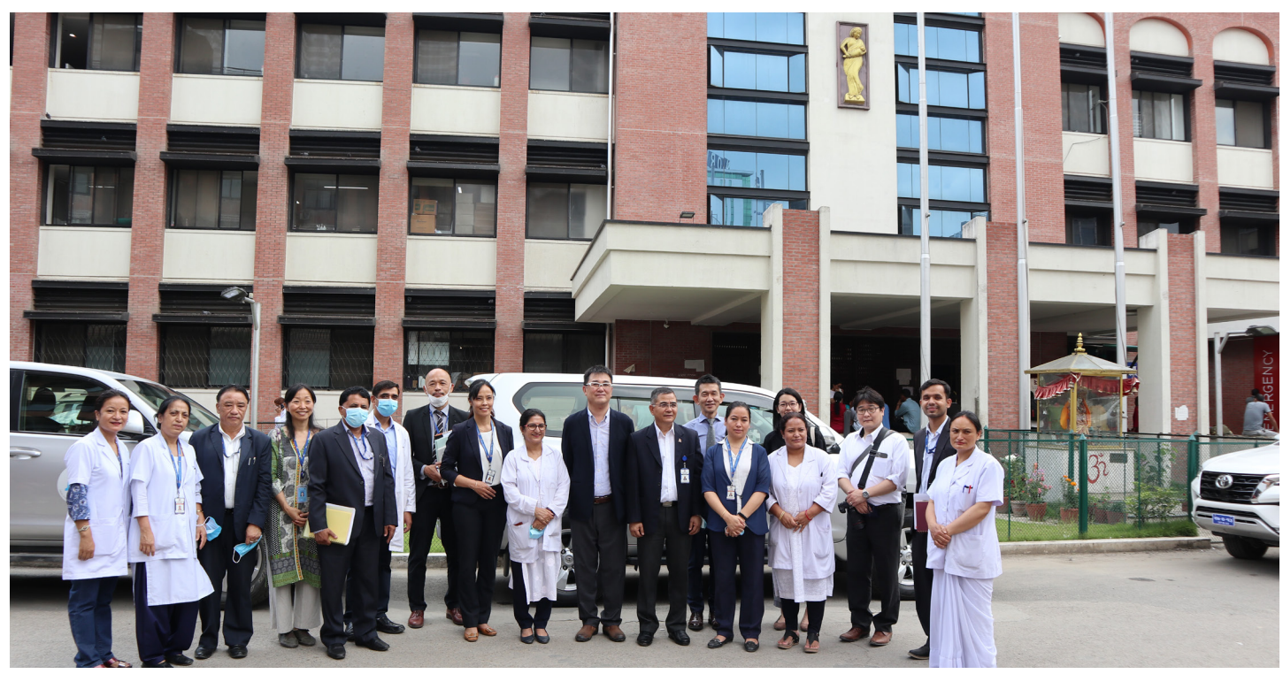
Officals from Embassy of Japan and JICA Nepal with the staff members of Paropakar Maternity and Women's Hospital in Thapathali.