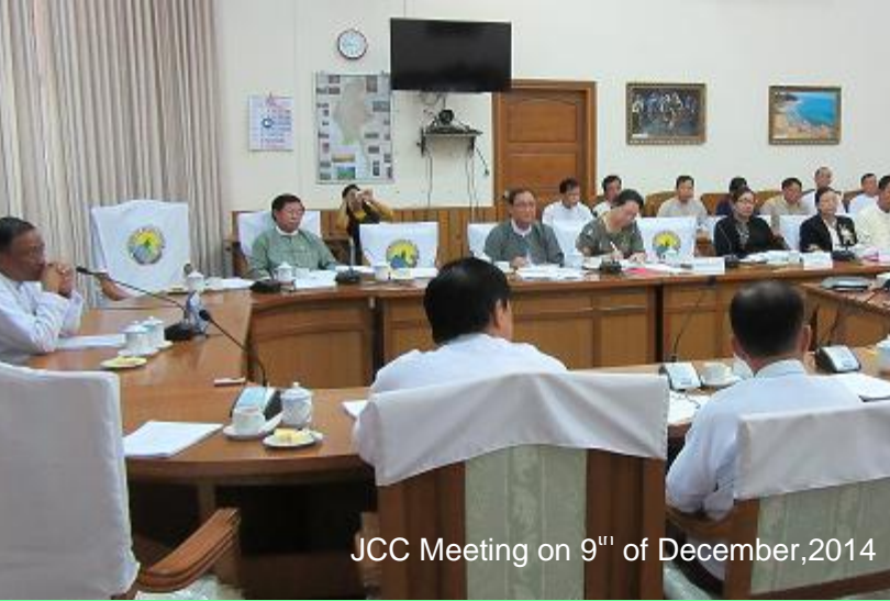
JCC Meeting on 9 th of December, 2014