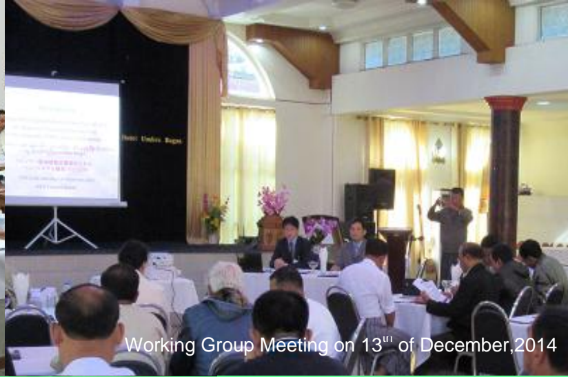
Working Group Meeting on 13 th of December, 2014