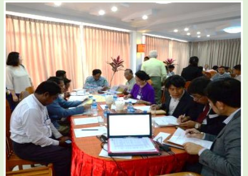
The Second Working Group Meeting was held at Floral Breeze Hotel, New Bagan.