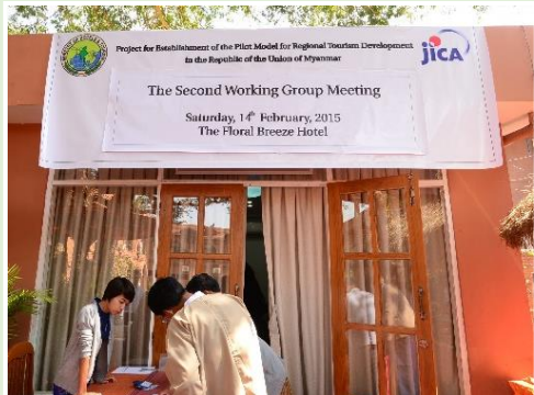
The Second Working Group Meeting was held at Floral Breeze Hotel, New Bagan.