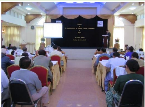
The First Seminar was held at Umbra Hotel, Nyaung U Township.

H.E. U Htay Aung, Union Minister, MoHT made opening remarks in the seminar. Project outlines and work progress of project activities were presented by Team Leader of JICA Expert Team and representatives of each WG. In the seminar, there were presentations by MoHT, Ministry of Culture (MoC), Myanmar Tourism Federation (MTF) regarding present and future of Myanmar and Bagan, and conservation and protection of heritage sites. Various issues related to tourism development and conservation of heritage sites in Bagan were shared among participants at the seminar.