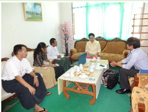
Website launched in Nay Pyi Taw with MITV (August, 2015)

Based on the discussion of WG1, The first-ever Bagan Tourism Website is under development aiming at its primary cutover in late September this year. The Website is considered as one of the most important tools in order to arouse international tourists for this tourism destination.