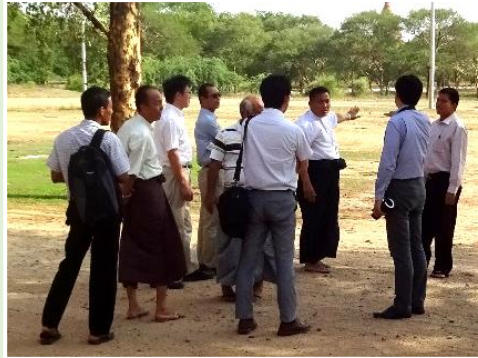
Site visit near Ananda Temple to find a location of Tourism Information Center (June, 2015)