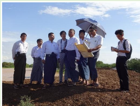
Site visit at Nyaung Lat Phat Pond to confirm a location of Viewing Point. (August, 2015)

WG2 has three construction projects: 1) Tourist Information Center, 2) Viewing Point, and 3) Tourist Routes. In order to find target sites for above mentioned projects, WG2 discussed with MoHT and relevant organizations such as General Administration Office of Nyaung U, MoCul, UNESCO, Team of Comprehensive Master Plan of Bagan under MoCul (members from Association of Myanmar Architects), and Ananda Pagoda Trustee.