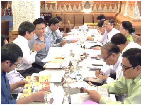
Working Group Discussion at Thanaka Museum Complex in Nyaung U (August, 2015)