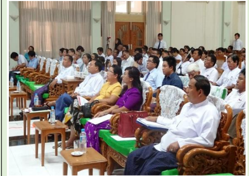
Public Awareness Seminar at Lacquerware School in Bagan (June, 2015)