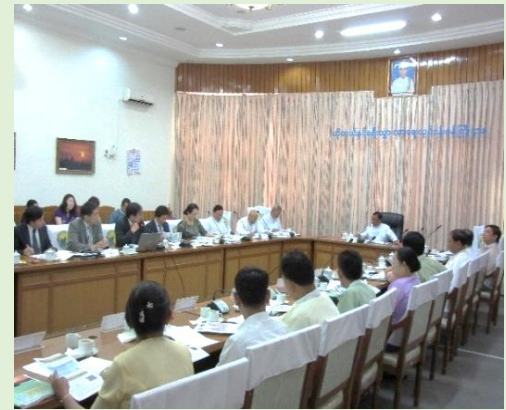
Union Minister delivered remarks at the 2 nd JCC Meeting at Nay Pyi Taw

tourist guides training and Public campaign for Output 3 (Tourism human resources). Union Minister of MoHT commented on the presentation regarding the leading pilot projects. After the discussion on the meeting, 11 projects were officially approved as pilot projects in addition to the leading pilot projects. The selected pilot projects are as shown in the table below. JET requested Union Minister and other relevant ministries for continuous support for preparation and implementation of pilot projects.