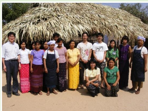
Group photo after Trial Cooking Village tour in West Pwa-saw village, Bagan (February, 2016)