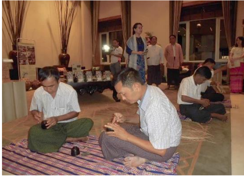
Handicrafts demonstration by villagers and WG1 members at Kempinski Hotel (November, 2015)