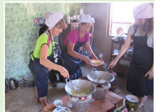
The guests are participating in cooking process in West Pwa-saw village, Bagan (February, 2016)