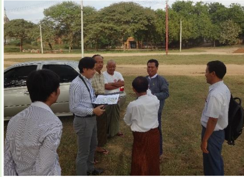
Proposed target site for Tourism Information Center (December, 2015)