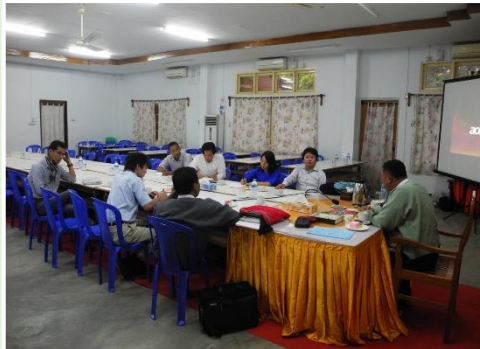
Discussion about infrastructure between JICA and District Chairman (December, 2015)

A conservation expert from Japan Cultural Heritage Consultancy visited Bagan in December, 2015, to conduct Heritage Impact Assessment (HIA). This is an assessment to check the impacts by the development projects to the heritage area. According to the report of HIA, all three pilot projects of tourism infrastructure (TIC, Viewing Mound, and Tourist Route) will not have a negative impacts on the historical environment. Furthermore, it is reported that these projects would contribute not only for the tourism, but also for the heritage conservation.