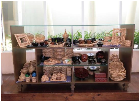
Handicrafts display by villagers and WG1 members at Thingaha Hotel (November, 2015)

Bagan local handicrafts display as a part of CBT Pilot Project activities started on November 11, 2015, at two hotels in Nay Pyi Taw which were generous enough to freely provide our project team with a space for the display. An opening campaign was held at "The Thingaha Hotel" and "Kempinski Hotel" inviting hotel guests and visitors on the same day including a demonstration of handicrafts production process by craftsmen from the two representative villages in Bagan: Myitche Village for cane products and West Pwa-saw Village for lacquerware products. A lot of foreign and Myanmar guests and visitors listened carefully to the MoHT director, Daw Khin Than Win who explained about the essence of CBT pilot project, and enjoyed the fine works of the Bagan artisans. The display continues until the end of February, 2016. It is expected that more foreigners know more about Bagan villagers life and products.