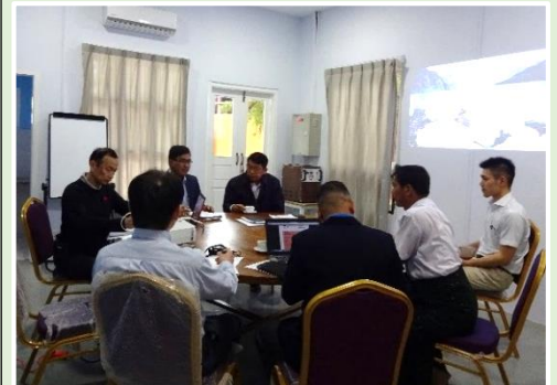
Working Group 3 Internal Meeting at JICA Project Office (January, 2016)

As part of Human Resource Development in Tourism Industry, Hotel Front Office Training, Food & Beverage Service Training and Tourist Guides Training were already conducted in August, 2015. According to the information released by MoHT (Bagan), three graduates from the training programs by JICA have conducted the MoHT led Training Program for the Hotel and F&B staff in October.