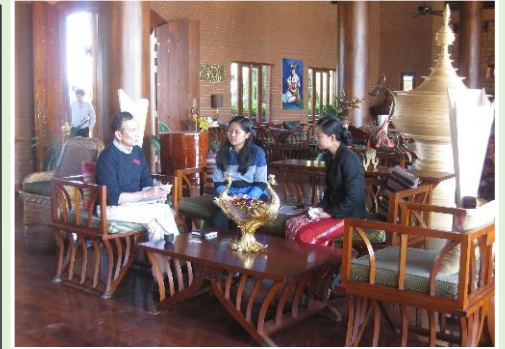
Interview with the FO Manager at Bagan Lodge Hotel (January, 2016)