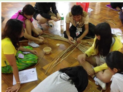
The Handicraft Demonstration Class in Yangon (February, 2016)

Some of guests requested cooking recipes of Bagan dishes. More than that, the village leader and villagers who were helping cooking tour thanked the pilot project. They were happy to learn CBT and its outcome. Working Group 1 will continue to develop these activities and acknowledge that there is still some more to do for improvement.