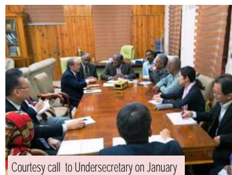
Courtesy call to Undersecretary on January