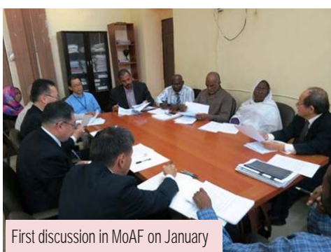
First discussion in MoAF on January