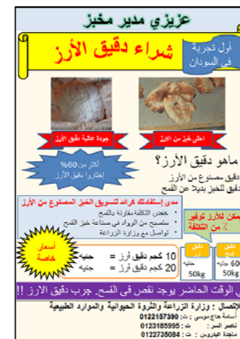
Pamphlet for promoting rice flour

Marketing is another key issue for rice production. After milling of paddy rice, only about 60% of it becomes white rice (unbroken rice). Rice flour is also produced during milling, so the Project tried to use the rice flour for making bread. After several trials in Rice Promotion Unit in Gezira SMOA, they found the good proportion with 40% of rice flour and 60% of wheat flour. The cost of rice flour is cheaper than wheat flour. 800 rice breads were made for trial sale and all of them were sold.