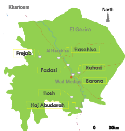
Location of 7 Rice Milling Units (RMUs) in Gezira

Rice milling is one of key activity for trial-sales of milled local rice in Gezira State. There are 12 Rice Milling Machines in Gezira State (7 locations). By the end of October, Gezira SMOA have set at 4 locations as shown in the map (7 machines) with 3-phase power supply (Hasahisa, Fadasi, Hosh & Barona).