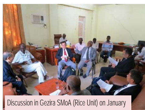
Discussion in Gezira SMoA (Rice Unit) on January