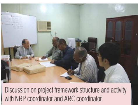
Discussion on project framework structure and activity with NRP coordinator and ARC coordinator