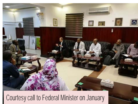
Courtesy call to Federal Minister on January