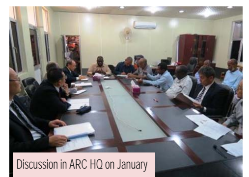
Discussion in ARC HQ on January