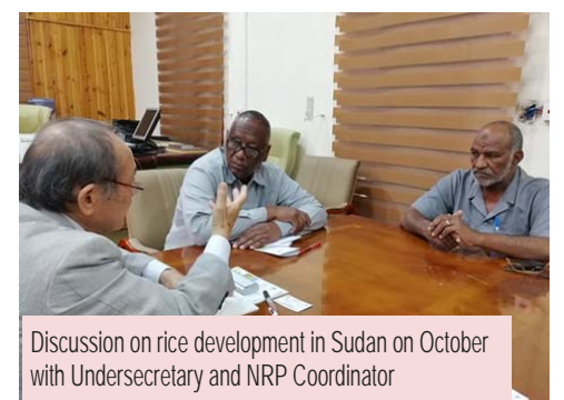
Discussion on rice development in Sudan on October with Undersecretary and NRP Coordinator