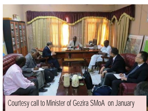
Courtesy call to Minister of Gezira SMoA on January