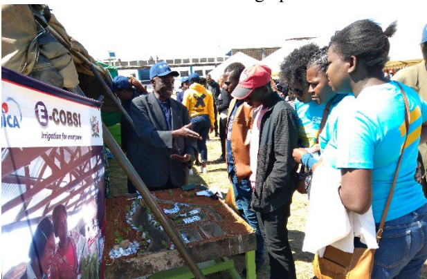
Many visitors including female and male, students and children are impressed by COBSI approach and farmers' explanation.

In Central Province, CPU members together with representative farmers from the E-COBSI District Model Site operated the PACO's booth. At the Central Provincial show, the farmers said more than 150 visitors visited miniature COBSI model and explained how the COBSI works and its high performance.