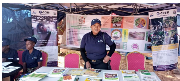
They displayed the information of their activities very well!

Unfortunately, E-COBSI team members did not visit the Provincial Agriculture Show at Muchinga Province, the CPU reported that they got a first prize out of the government institutions. CONGRATUATION!