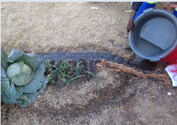
Demonstration of COBSI was done at Chitambo and Serenje Districts' booth.

CONTACT: ecobsi.zambia@gmail.com BACKNUMBER: https://www.jica.go.jp/project/zambia/020/newsletter/index.html (JAPANESE SITE)