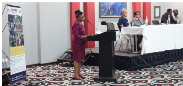
Acting PS of MoA gave opening remarks.