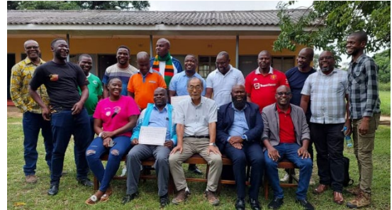
The participants of the permanent weir training in 2023 at MFI.

On 1 st December, 15 engineers in the New-Target Provinces completed the Permanent Weir Training at Masaiti Farm Institute (MFI). This training program was implemented in response to the recommendation from the terminal evaluation mission in September 2023. It was the second time training, following the first one in 2021. The training contents were similar to the first one, but this time, it aimed for the participants to learn knowledge and skills on permanent weir construction, considering the construction under ZAMGRO or the other donors. Before the training at MFI, Mr. Chiba, an irrigation engineer of E-COBSI, and the participants conducted the field survey to collect information on the candidate sites for the permanent weirs in November 2023. Based on the field survey, the participants worked on drawing the permanent weir, construction schedules, and cost estimations at MFI from 27 th November to 1 st December. SIEs in the New-Target Provinces (Mr. Bwalya, Ms. Cheelo, and Mr. Sampule) led the sessions, and Mr. Chiba gave them some technical advice and supplemental explanations. According to Mr. Chiba, SIEs understood basic ideas about permanent weir constructions and managed the training very well on their own.