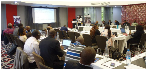
ALL provincial CPUs reported the project activity progress, challenges and lessons & learnt in 2023.

The national CPU meeting has changed the agenda every year to the activities of that year, but the main report is on the activities of the respective provincial CPUs and their activity plans for the following year. In addition to these reports, the result of the end-line survey and the 3-year action plan for post-E-COBSI, which was approved by MoA PS, were reported this year.