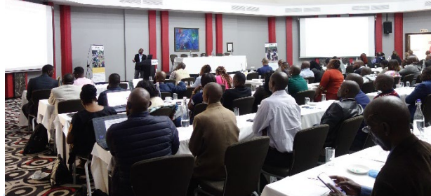
A presentation for the achievements of E-COBSI by CPU members. 128 people gathered for the completion seminar.