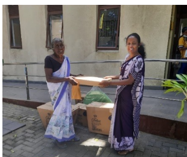
Bathroom & sanitary ware distribution