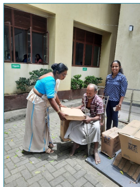
Handing of bath wear and sanitary ware