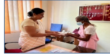
Coordinating housing construction