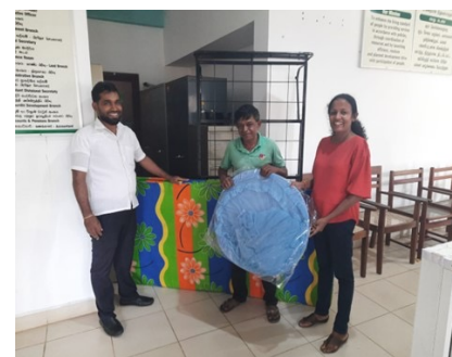
Distributing mattress and mosquito net