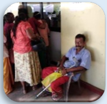
Elderly patients waiting for consultation.

Referral: After diagnosis, patients were referred to respective clinics at Polonnaruwa General Hospital. Health Education Sessions were conducted by renowned healthcare professionals to educate elderly people about various health topics such as nutrition, exercise, mental health, and preventive measures to ensure a healthy and active lifestyle.