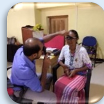
Screening for eye disease