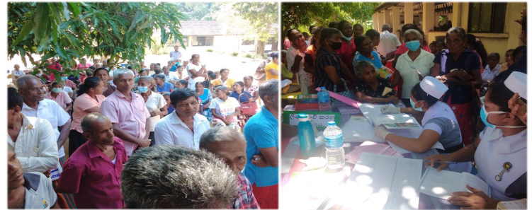
Polonnaruwa mobile health clinic participants and staff