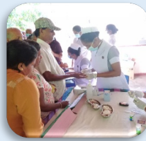
Screening for Non-Communicable Diseases