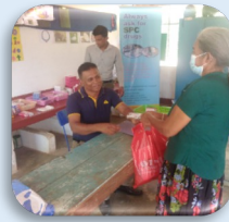
Prescription of free drugs to all patients