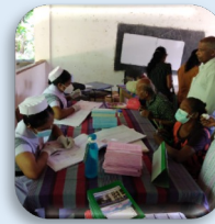
Patients referral system by using clinic book