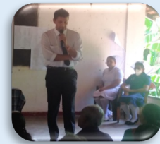
Health Education Sessions