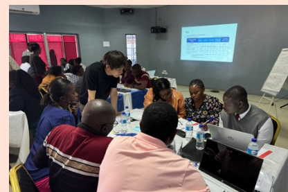
Group work on QC story