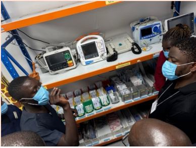
A nurse in the Muhimbili Hospital explaining how they are managing the stock in the ward by using 5S tools.

The team visited Mbeya Zonal Referral Hospital and Muhimbili National Hospital, observing best practices in quality management and discussing how management can support ongoing quality improvement. The Zimbabwean participants gained practical knowledge on using the 5S tools effectively, fostering motivation across hospital staff, and cost management for improving hospital service delivery.