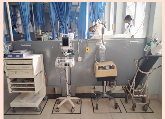
Good practice confirmed in Sally Mugabe Central Hospital during the M&E

The finalized May 2024 M&E report was shared and discussed during the training sessions in August and September 2024. Additionally, the third round of external M&E was kicked off in September 2024 to ensure continued monitoring and technical support. The project team is dedicated to working hand-in-hand with the target hospitals and PHEs to nurture a culture of continuous improvement in health services, ultimately enhancing the quality of care for everyone involved.