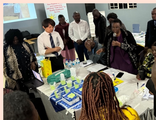
Presentation during 5S practice session