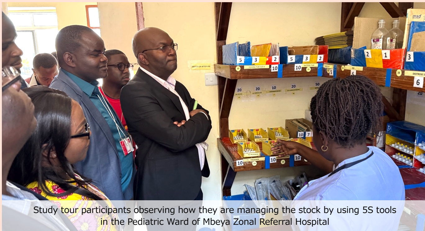
Study tour participants observing how they are managing the stock by using 5S tools in the Pediatric Ward of Mbeya Zonal Referral Hospital