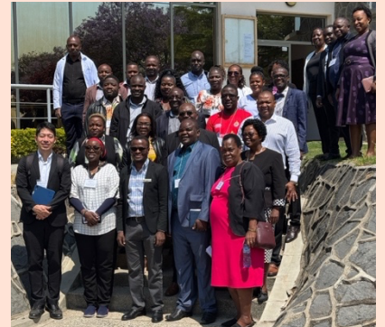
Group photo taken in the Mbeya Hospital

The team visited Mbeya Zonal Referral Hospital and Muhimbili National Hospital, observing best practices in quality management and discussing how management can support ongoing quality improvement. The Zimbabwean participants gained practical knowledge on using the 5S tools effectively, fostering motivation across hospital staff, and cost management for improving hospital service delivery.