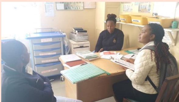
QAPS staff (right in the photo) conducting M&E at Gwanda Provincial Hospital

From May to June 2024, ZIM-QIPS project team carried out the second round of external Monitoring and Evaluation (M&E) at 14 target hospitals and ten Provincial Health Executives (PHEs) to assess quality improvement (QI) activities through the 5S-KAIZEN-TQM approach.