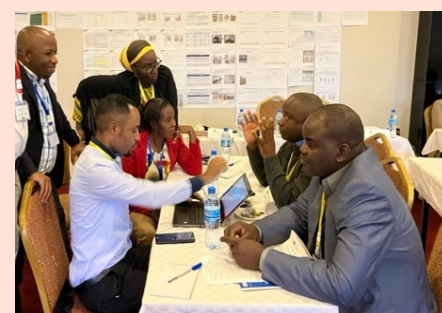
Group discussion on how to solve the issues raised during the implementation of 5S-KAIZEN-TQM (regional seminar)

On October 7 and 8, two representatives from the QAPS Directorate attended the Regional Seminar in Arusha as observers, that was organized by another JICA project. Participants from seven African countries shared their achievements and challenges with 5S-KAIZEN-TQM Approach, providing the Zimbabwean team with valuable insights, especially on sustainability strategies. The delegation then traveled to Dar es Salaam, where they shared these insights with the other Zimbabwean participants. [...go to the next page]