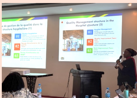
QI implementing structure in Tanzania presented by Ministry of Health of Tanzania (regional seminar)

From October 6 to 12, 2024, a study tour was conducted in Tanzania, involving 16 participants from Zimbabwe's Ministry of Health and Child Care (MoHCC), including representatives from the Quality Assurance and Patient Safety (QAPS) Directorate and hospital management. Organized as part of the ZIM-QIPS Project, the main purpose of the tour was to clarify practicable ideas for further improvement of healthcare service provision as well as hospital management, by utilizing 5S-KAIZEN-TQM approach from Tanzania's experiences.