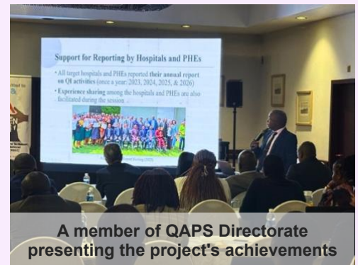
A member of QAPS Directorate presenting the project's achievements

The ZIM-QIPS Project reached its grand finale with the successful hosting of the 3rd Annual Progress Report Meeting held in Harare from March 16th to 18th, 2026. Bringing together 112 participants, including representatives from the Ministry of Health and Child Care (MoHCC), Provincial Health Executives (PHEs), target hospitals, district hospitals, development partners, the Embassy of Japan in Zimbabwe, and JICA, the meeting served as a vibrant platform to celebrate the immense progress made over the past years.