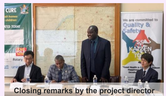
Closing remarks by the project director

Participants reviewed the project's achievements and engaged in lively discussions on how to overcome remaining challenges. Crucial topics included appointing dedicated QI focal persons at both the PHE and hospital level, and securing internal funding through operational improvements to strengthen sustainability.