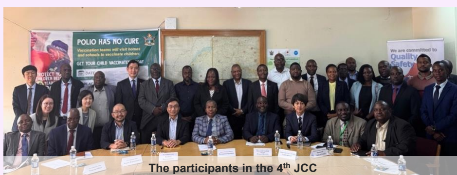
The participants in the 4 th JCC

The QAPS Directorate also presented the highly anticipated "Roadmap for Strategic and Sustainable Implementation of Quality and Patient Safety Initiatives (2026–2030)." This roadmap outlines the policy to embed QI activities into the national health system. While the JICA-supported phase of the project is coming to an end, this roadmap ensures that the MoHCC will continue to lead, scale, and sustain these vital QI initiatives independently for years to come!