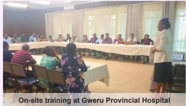
On-site training at Gweru Provincial Hospital

The first two days focused on capacity building, successfully training over 1,600 hospital staff nationwide, including Department Heads, members of Quality Improvement Team/Quality Assurance Department (QIT/QAD), and members of Work Improvement Team (WIT). The training covered crucial topics such as the roles of department heads and QIT/QAD in quality management, monitoring and evaluation, patient satisfaction, and incident reporting. On the final day, the QAPS Directorate conducted direct interviews with Hospital Management and QIT/QAD, providing tailored advice based on actual workplace observations.