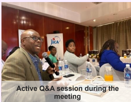
Active Q&A session during the meeting

During the three-day event, target hospitals and PHEs proudly presented their annual reports, creating a dynamic environment for peer learning and knowledge sharing. By exchanging experiences on both