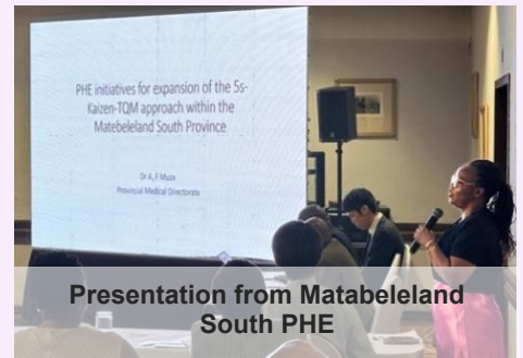
Presentation from Matabeleland South PHE

A notable highlight was the confirmed expansion of 5S-KAIZEN activities to the district level. The Matabeleland South PHE reported on their initiatives to roll out the 5S-KAIZEN-TQM approach to district hospitals. And, Plumtree District Hospital, Chipinge District Medical Office, and Kadoma General Hospitals also presented their own unique good practices. It was truly inspiring to see how deeply the KAIZEN mindset for continuous improvement has taken root in Zimbabwe's healthcare system!