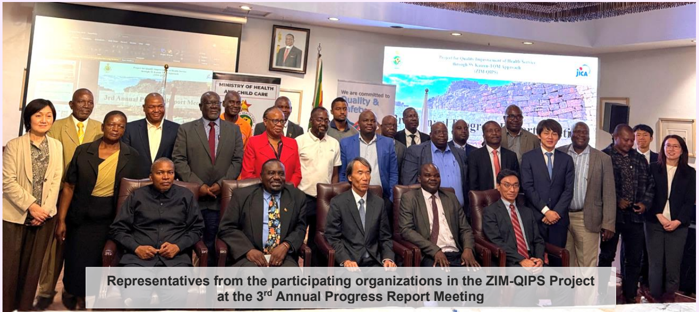
Representatives from the participating organizations in the ZIM-QIPS Project at the 3rd Annual Progress Report Meeting