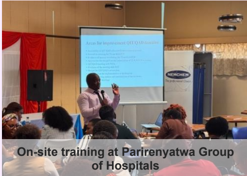
On-site training at Parirenyatwa Group of Hospitals

To ensure the sustainability of QI activities and to strengthen the implementation capacity of each facility, the QAPS Directorate successfully conducted three-day intensive on-site trainings on QI activities for each of the 14 target hospitals between January and February 2026.