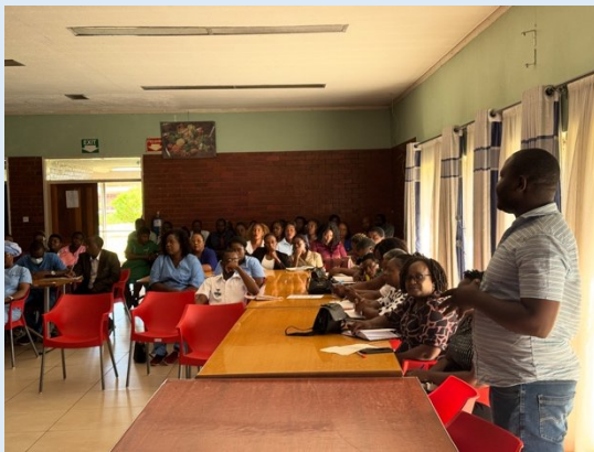
Deputy Director of QAPS facilitating onsite-training session for WITs (Chitungwiza Central Hospital)

From January to February 2025, on-site trainings were held for Heads of Department (HoDs) and WITs at 14 target hospitals. These sessions aimed to strengthen practical skills for implementing the 5S-KAIZEN-TQM Approach, based on challenges identified during the 3 rd round of external M&E.