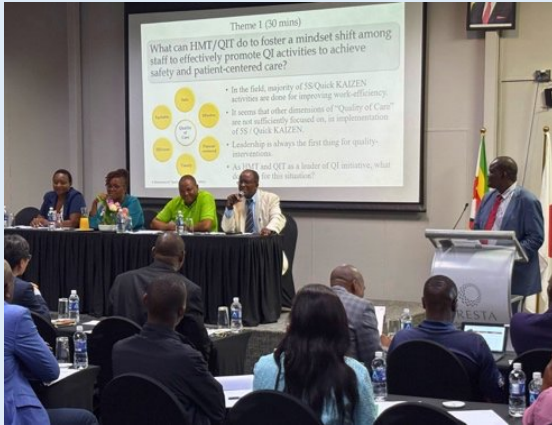
Director of Quality Assurance and Patient Safety Directorate (right in the photo) facilitating the panel discussion

Two panel discussions were held: (i) how to foster a mindset shift among staff to effectively promote QI activities for safe and patient-centered care and (ii) how to promote the collaboration between the Hospital Management Team and PHE for effective QI activities in hospitals. Pannelistes selected from some PHEs and hospitals emphasized leadership and collective effort in driving sustainable improvements.