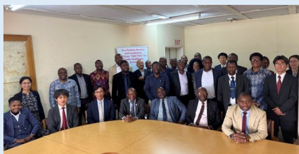
Group photo of the 3 rd JCC participants

QI initiatives beyond the project's completion, including necessity of updating the National Quality Policy and Strategy, securing budgets for QI activities, and strengthening capacity-building of healthcare staff, and monitoring systems. While some discussions are ongoing, the meeting laid a strong foundation for a future roadmap to ensure MoHCC-led, sustainable QI efforts. The project will continue collaborating stakeholders to advance quality health services during its final implementation phase.