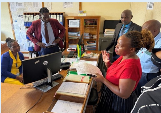
Participants testing the new M&E tool at the Midlands PHE office

The updated tool is expected to reduce staff burden and support sustainable QI promotion. Finalization will follow its use in the 4th round of external M&E, starting in April 2025.