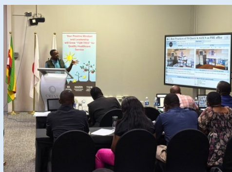
Presentation of good practice of Quick KAIZEN by Matabeleland North PHE

The 2nd Annual Progress Report Meeting on Quality Improvement of Health Services was held in Harare from 25 th to 27 th February 2025, bringing together 108 participants, including representatives from the Ministry of Health and Child Care (MoHCC), Provincial Health Executives (PHEs), target hospitals, development partners, the Embassy of Japan in Zimbabwe, and JICA Zimbabwe Office.