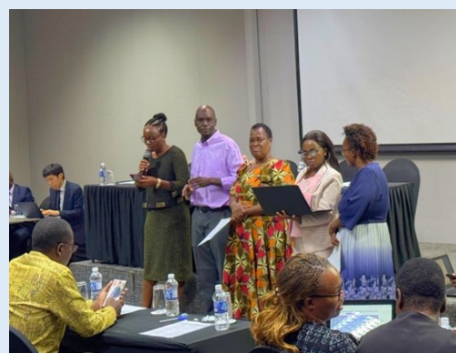
Participants presenting their post-study tour initiatives

Additionally, Kadoma General Hospital shared its ongoing 5S activities, emphasizing the importance of sustaining QI efforts. An online session with Allada-Toffo-Ze Zonal Hospital in Benin highlighted their continuous application of 5S-KAIZEN-TQM since 2019. The hospital director stressed the value of data-driven approaches in maintaining staff motivation and achieving sustainable improvements. [...go to the next page]