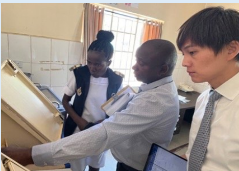
Technical support on 5S activities for the emergency medicine trolley in the inpatient ward (Gweru Provincial Hospital)

The results showed the steady progress: 11 hospitals have started KAIZEN with QC story, and 10 hospitals achieved QIT/QAD function scores above 70%. However, no hospital reached our project target score (70% of M&E score of 5S-KAIZEN) with common challenges related to standardizing 5S practices, self-monitoring, utilization of customer satisfaction survey results, and the promotion of patient safety measures at the department level.