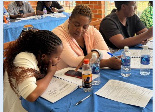
HoDs discussing their own roles in QI activities (Marondera Provincial Hospital)

The project expects that the strengthened leadership of HoDs and well-capacitated WITs on 5S-KAIZEN activities will lead to QI activities for service quality and patient safety.