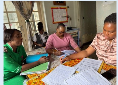
Interview with WIT to assess the status of their QI activities (Victoria Chitepo Provincial Hospital)

From September to November 2024, ZIM-QIPS project team with external assessors from some target hospitals and PHEs carried out the 3 rd round of external Monitoring and Evaluation (M&E) to assess QI activities through the 5S-KAIZEN-TQM approach and to provide necessary technical supports for 14 target hospitals and 10 PHEs.