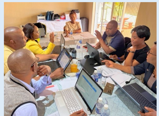
Participants discussing revision points for the M&E tool

Based on frontline staff' feedback, the revision aimed to make the tool more practical and user-friendly while maintaining its focus on 5S-KAIZEN practices. Field tests were conducted at Gweru