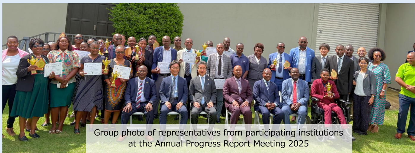
Group photo of representatives from participating institutions at the Annual Progress Report Meeting 2025