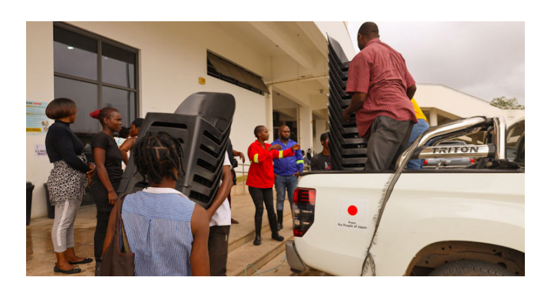
Community volunteers helping to offload chairs for Heroes Stadium CTC

ince the cholera outbreak was announced by the Zambian government in October 2023, the JICA Cassiopeia Project has been providing technical support to the Ministry of Health by focusing on the five first level hospitals (Chawama, Chilenje, Chipata, Kanyama and Matero) that are part of the projects' mandate to building management capacity. This support has extended to the cholera treatment center (CTC) that was opened at Lusaka's Hero Stadium.