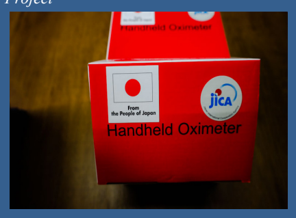
Handheld oximeters provided for the CTC Stadiun by the JICA Cassiopeia Project