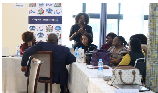
MDD facilitator helping BSC workshop attendees during group work in Chongwe