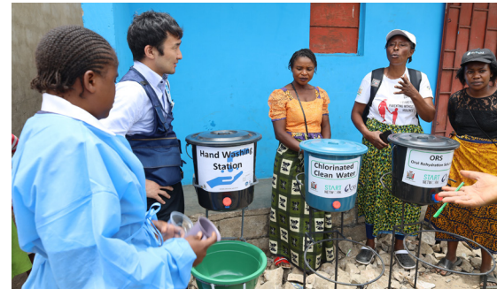
Community Based Volunteer asking questions at the setting up of ORPs in John Laing compound