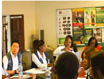
Workshop participants during a plenary session

Kanyama and Matero to evaluate how the various departments at the facilities are adhering to IPC protocols in their work environment as well as personal hygiene of staff.