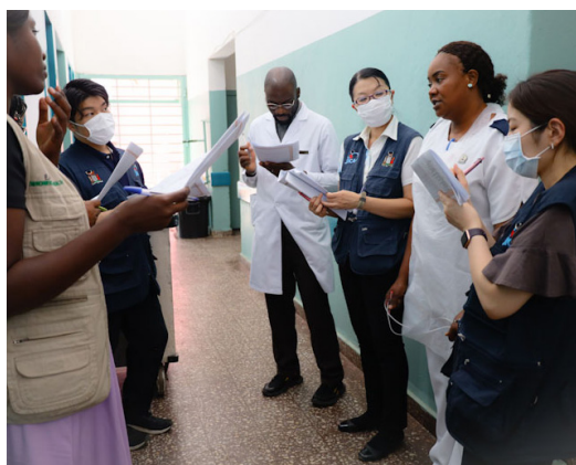
JICA Cassiopeia experts with the ICT group at Chipata FLH conducting IPC rounds in the NHIMA ward

The departments visited were NHIMA, OPD, chest clinic, radiology, casualty, dental, VMMC, old theater and IPD wards where the group were met by IPC champions whom they exchanged views with on the gaps identified by ICT as well as the staff in areas that can be improved upon. The ICT is using a checklist that was developed by the Cassiopeia Project together with the Chilenje FLH ICT for use in the 5 FLHs that the project works with. The checklist is a list of questions which each team member and the departmental IPC champion must answer in terms of adherence to IPC protocols in each department. At the conclusion of the round, the ICT team brainstormed on a possible deadline to carry out other rounds for the remaining departments.