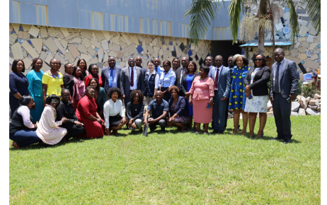
Attendees of the 7 day workshop conducted at MIKA Convention Center from February 5th to the 13th.

works with. She further highlighted on how the workshop was a timely and much needed accompaniment to the work that is being done by the hospitals in terms of using balance score cards in management decision making.