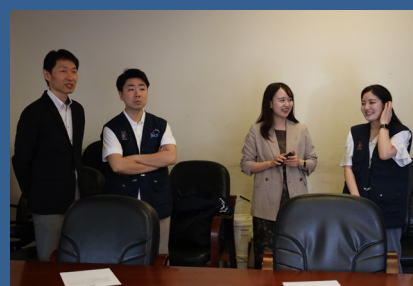
Below: JICA HQ and NCGM representatives at the hand over ceremony