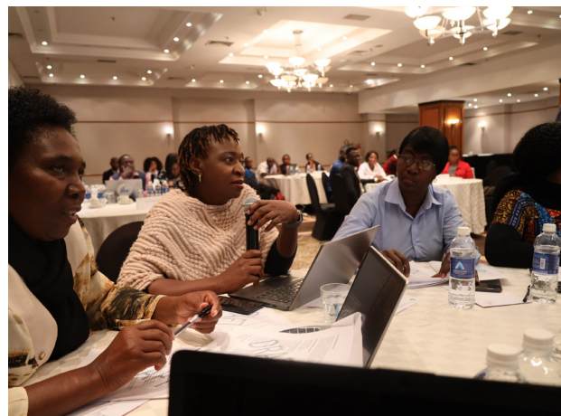
Participants contributing during the SSI Surveillance meeting