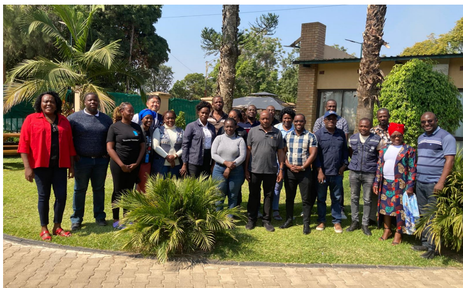
Photo 3: Group photo of participants at the Zambia National IPC Strategic Plan and Guideline meeting in Kabwe