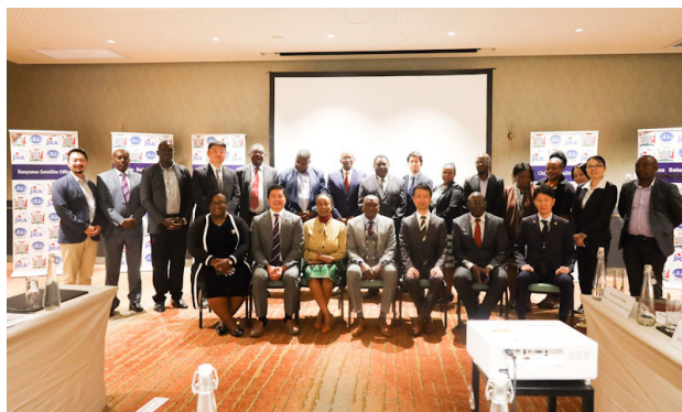
High table delegates for the 3rd Joint Coordination Committee meeting

D ignitaries from the Embassy of Japan, JICA Zambia, Ministry of Health (MoH), Lusaka Provincial Health Office (LPHO), Lusaka District Health Office (LDHO) and five first-level hospitals (FLHs) gathered on May 21st in Lusaka to attend the 3rd Joint Coordination Committee (JCC) which is the governing and official decision-making body of the JICA Cassiopeia Project chaired by the Project Director and consists of MoH, LPHO, LDHO and JICA Zambia targeting the five first level hospitals.