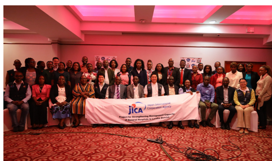
Group photo of participants during the Pharmacy Management Workshop