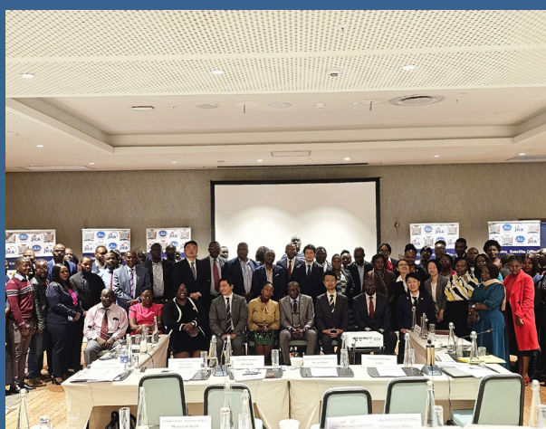
Group photo of the 3rd JCC participants held on May 21st 2024