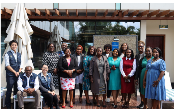
KCCP participants during their inception report presentation