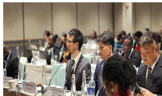
JICA Country Representative, Embassy of Japan Second Secretary Economic Cooperation Affairs /Section and JICA Cassiopeia Chief Adviser at the 3rd JCC meeting