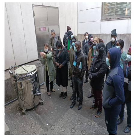
Participants touring the waste management facility

Additionally, he emphasized the need to establish medical equipment safety management committees and expand the adoption of management by objectives (MBO) through the widespread use of BSC across facilities and departments. Furthermore, he stressed the importance of developing and implementing SOPs for Planned Preventive Maintenance (PPM), which include ensuring that all end-users clean and disinfect equipment before submitting them to the MET department. He also highlighted the need for quarterly IPC-MET meetings to enhance collaboration.