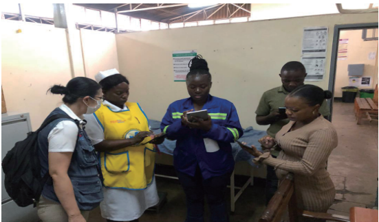
Matero IPC team conducting 5th IPC round on 11th February, 2025