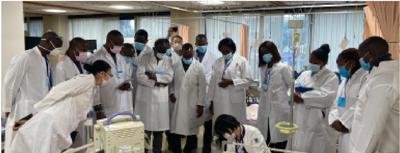
KCCP participants at NCGM in Tokyo where they toured the health facility with a concentration on hospital management, IPC and medical equipment management

H ealth professionals from the Lusaka Provincial Health Office (LPHO), Lusaka District Health Office (LDHO), the five First Level Hospitals (FLHs) (Chawama, Chilenje, Chipata, Kanyama and Matero) undertook training in Japan under the JICA Cassiopeia Project in collaboration with the National Center for Global Health and Medicine (NCGM) and other stakeholders from January 14th to January 31st, 2025.