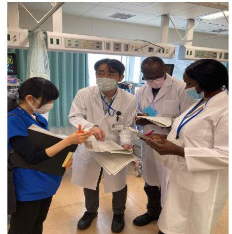
Participants taking part in an IPC round at a hospital in Tokyo, Japan

Dr. Sianchapa stated that the training in Japan led to several action points, including the establishment of IPC committees to strengthen scale up of the adoption and implementation of standards operating procedures (SOPs) and related IPC activities in other facilities under the DHO.