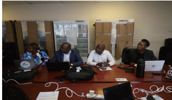
Participants during the Pharmacy Quarterly Meeting held on February 26th, 2025 at LPHO