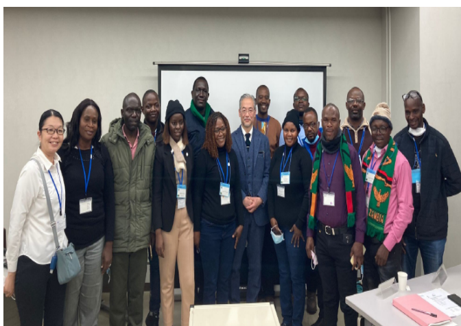
Participants being welcomed to the KCCP training