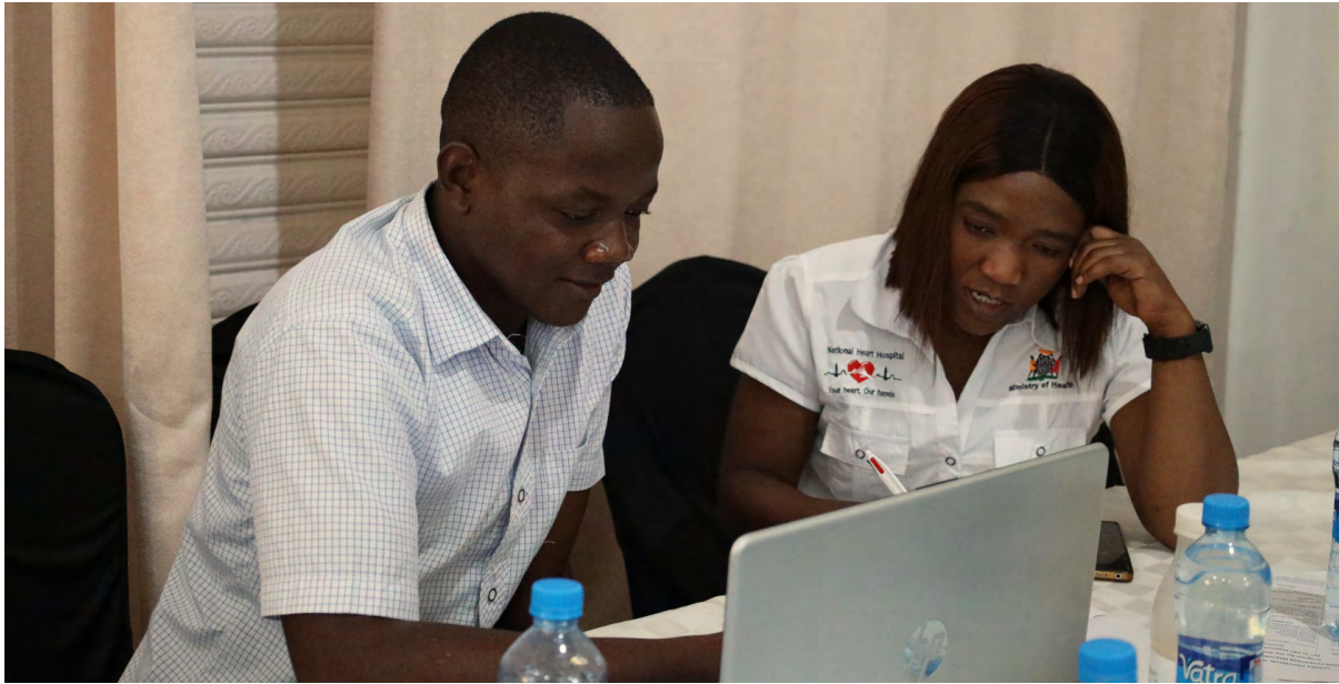
Participants doing an exercise during the SSI guidelines and SOPs dissemination

F rom 16 to 19 September 2025, the Lusaka Provincial Health Office (LPHO) held a dissemination meeting for Surgical Site Infection (SSI) Surveillance Guidelines and Standard Operating Procedures (SOPs); the National Strategic Plan for Infection Prevention and Control (2022-2032); and the National Infection Prevention and Control Technical Guidelines for all first level, second and tertiary hospitals in Lusaka province and four general hospitals in four other provinces: Western, Eastern, Southern, and Copperbelt.