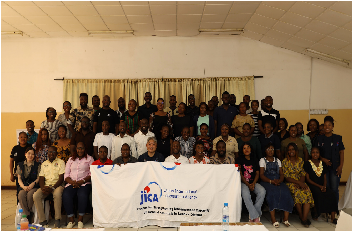
Participants at the Kanyama Sub-District Cholera Preparedness workshop that was held from 14th to 17th of October, 2025 in Lusaka.

KANYAMA FIRST LEVEL HOSPITALS HOLD CHOLERA PREPAREDNESS TRAINING FOR SUB-DISTRICT