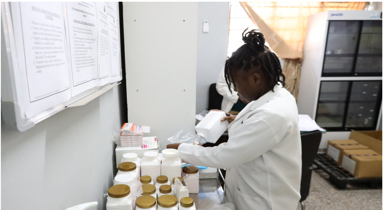
A pharmacy student intern from Eden University working in the Chawama satellite pharmacy

Overall, the two facilities have embraced the incorporation of the satellite pharmacies and hope it becomes a standard practice across all facilities that would benefit from it.