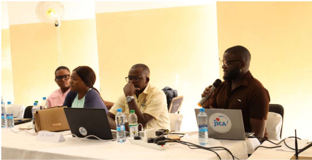
Participant making a contribution during the cholera preparedness workshop for Kanyama Sub-District

K anyama sub-district, under the auspices of Kanyama First Level Hospital, with technical support from the JICA Cassiopeia Project conducted a four-day training in cholera preparedness from October 14th to 17th, 2025.