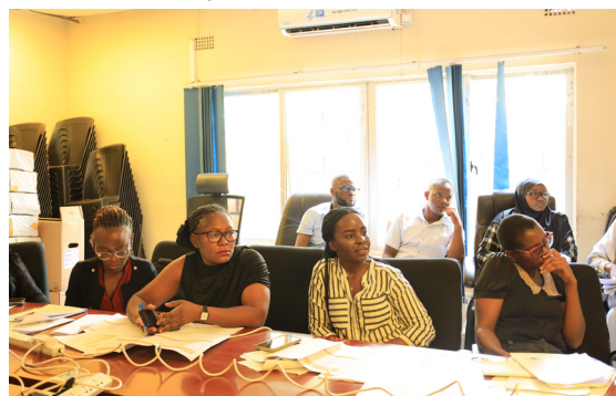
Participants during the LPHO standardisation meeting on infection prevention and control SOPs held on February 5th, 2026