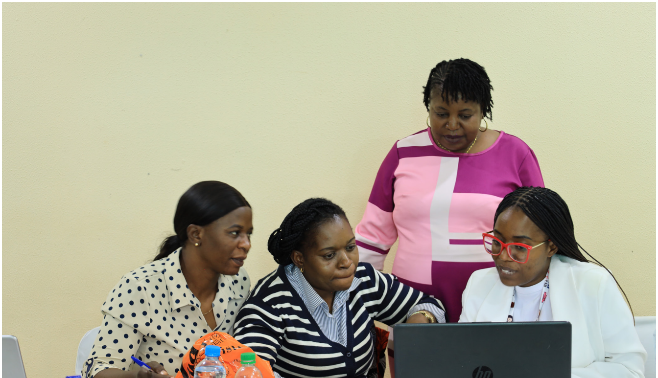
Participants doing group work during the 5-day Quality Improvement Training held by Kanyama First Level Hospital for the 5 First Level Hospitals in Lusaka District from the 23rd to the 27th of February, 2026

KANYAMA FIRST LEVEL HOSPITAL HOLDS QUALITY IMPROVEMENT TRAINING FOR THE FIVE FIRST LEVEL HOSPITALS IN LUSAKA