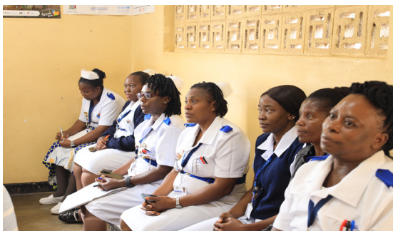
Heads of departments participating in the Balanced ScoreCard review at Chelstone Zonal Hospital on 10th February, 2026