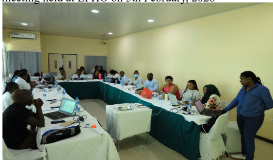
Presenter from Chilenje FLH presenting their QI project on Neo-Natal Sepsis at the quality improvement training at ZAMCOM Lodge