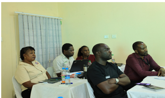
Facilitators listening to the presentations during the quality improvement training held at ZAMCOM Lodge by Kanyama FLH