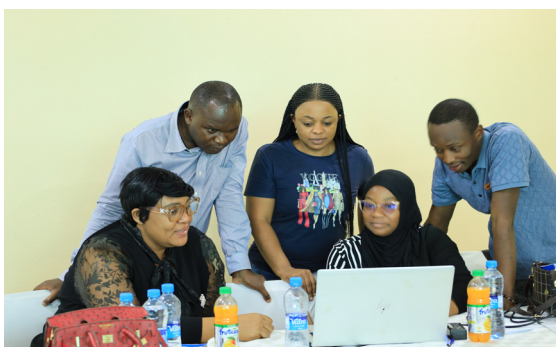
Kanyama FLH participants doing group work during the quality improvement training