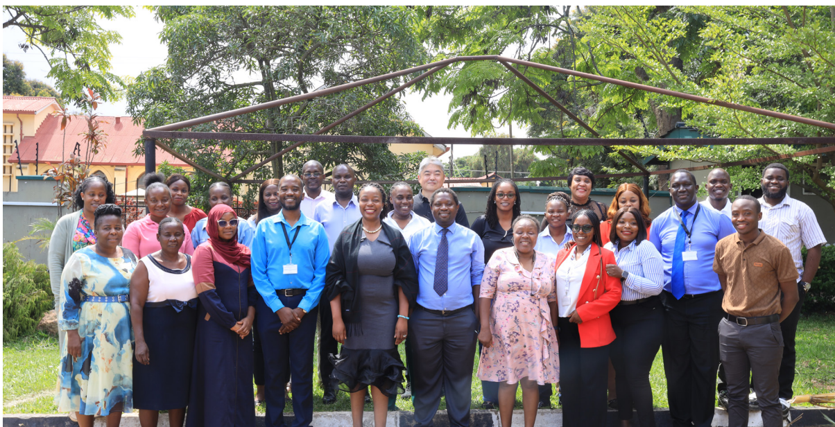
Group photo of participants during the 5-day quality improvement training held at ZAMCOM Lodge in Lusaka by Kanyama FLH for the 5 First Level Hospitals in Lusaka District

The training ended with facilities being instructed to finish the QI projects they identified during the training and submitted them for further review by the facilitators and other participants to take advantage of the collaborative nature of the training.