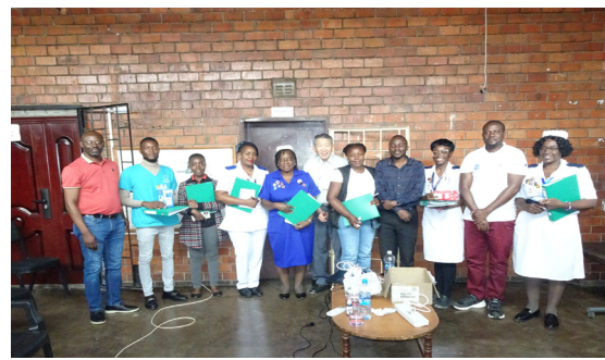
Group photo of Medical Equipment Champions, MET and project short-term expert at Chipata FLH after a reorientation meeting