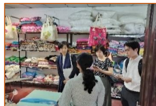
Mission observing products of WE

The mission conducted a field visit to Monaragala and Ampara Districts from June 16-18, 2025. Meetings were held with 4 WAS members, 7 WEs, concerned WDOs and Women Development Field Assistants (WDFAs) to review the progress and achievements made by the Project over the past two years. The mission confirmed that, through the Project activities,