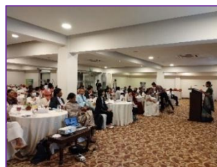
The participants of the event

To WEs linked with identified and potential resource organisations (ROs), an event of networking was organised by the Project on June 19 th . Altogether 70 participants, including 16 WEs under the Project, participated in the event with their products, which were showcased at the event.