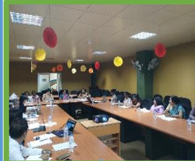
JCC meeting, July 11