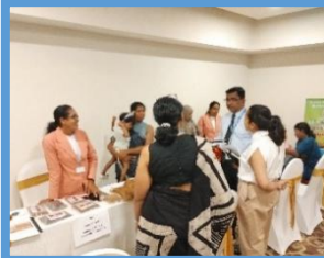
Match making at the networking event, June 19th