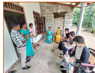
The missions in a group discussion