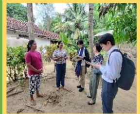
JICA Headquarter Monitoring Mission