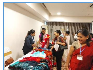
Gallery walks at Networking Event

The ROs and WEs met together to discuss potential match-making opportunities. During the session, WEs gained access to marketing, training, product promotions, trade fairs, finances, and exposure opportunities. Significantly, the Secretary of the Ministry of Women and Child Affairs, the Women's Bureau Director and staff, the JICA Headquarters delegation, JICA Sri Lanka staff, 16 ROs, and District-level WDOs attended the event. There are plenty of ROs expressing their willingness to liaise with these WEs for marketing and training opportunities. It is a good indicator that WB can follow up on this work with these ROs.