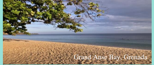
Grand Anse Bay, Grenada

JICA is a Japanese government agency responsible for executing Japanese Official Development Assistance (ODA). JICA has 96 overseas offices (as of July, 2020) and conducts ODA projects in 150 developing countries (during fiscal year 2019). JICA has offices in St. Lucia, Jamaica, Belize and Dominican Republic in the Caribbean. We are enhancing the capacity of DR office to serve better to Caribbean people.