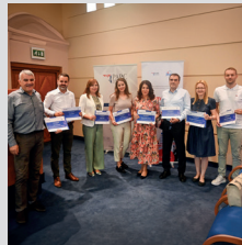
Project on Establishment and Promotion of Mentoring Service in Small and Medium Enterprises in the Western Balkans