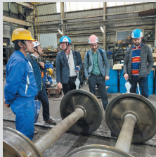
Urban Public Transport Management and Operation in the Western Balkans, Training participants in Japan

For the human resources development and the formulation of administrative systems of developing countries, technical cooperation involves the dispatch of experts, the provision of necessary equipment and the training of personnel from developing countries in Japan and other countries. The cooperation plans can be tailored to address a broad range of issues.