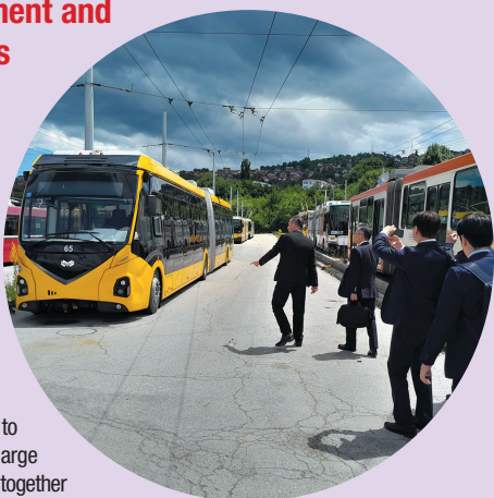
Sarajevo, new trolleybus - site visit of JICA's mission for preparation of the training program on public transportation operation and management for West Balkan Countries

The city of Sarajevo has been paying a lot of attention to public transport for a long time and is implementing large projects to make public transport as efficient as possible together with JICA's and other donors' support. With the aim to improve public transport management and operation capacity, the Ministry of Traffic Sarajevo Canton applied for JICA Regional Training together with the City of Skopje, Prishtina and Tirana to learn about Japan's experience and knowledge of planning and operating public transportation.