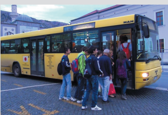
Yellow buses donated to the City of Mostar

Grants are the provisions of funds to developing countries that have low income levels, without the obligation of repayment. Grants are used for the improvement of basic infrastructures such as schools, hospitals, water-supply facilities and roads, along with obtaining health and medical care, equipment and other requirements.