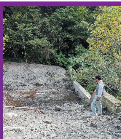
JICA Advisor's site visit to Topčić polje affected by floods in 2024.

The project aims to strengthen the capacity of public agencies for prevention and reduction of forest fires and other natural disasters with National Forest Fire Information System (NFFIS) and Ecosystem Based Disaster Risk Reduction (Eco-DRR). The project will provide dispatch of experts, training in Japan or third countries, as well as the provision of necessary equipment for the project activities. The project is expected to contribute to climate change mitigation and adaptation by strengthening the capacity of Bosnia and Herzegovina to promote innovative climate change solutions for the Western Balkan region.