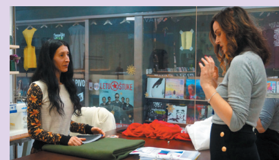
Mentoring service in Bosnia and Herzegovina

This regional project is a continuation of the successful cooperation in mentoring of small and medium sized enterprises, which Bosnia and Herzegovina joined in 2013. The Project successfully established the basis of a Mentoring Service in the Western Balkan countries by introducing the Japanese management method- KAIZEN, upgrading mentor evaluation and training systems, and promoting brand recognition of the standardized Mentoring Service region-wide. The aim of the ongoing regional project is to establish the Mentoring Service implementation structure in each country and strengthen the regional cooperation, which will lead to the improved quality, coverage, and sustainability of the Mentoring Service.