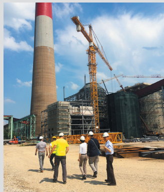
Flue Gas Desulphurization Construction Project for Ugljevik Thermal Power Plant

JICA supports the acceleration of developing countries' economic/social growth through the private sector, through debt and equity investment for the development projects of private companies.