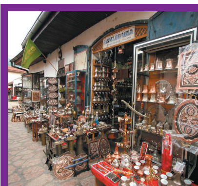
Baščaršija, Sarajevo old town

The Western Balkan region has diverse cultures and rich tourism resources. In 2019, 12 million people visited the region, generating the profit of EUR 7.2 billion for the entire region. Tourism is an important sector that accounts for 10.2% of GDP in the region. However, insufficient tourism infrastructure, tourism workers, and lack of connectivity between the tourist destinations in the region are some of the recognized issues. The project, therefore, aims at strengthening regional cooperation and promoting sustainable tourism in the region through the dispatching of an expert who will work closely with the ministries and tourism sector personnel in the Western Balkans.