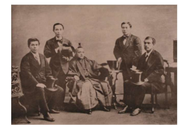
Members of Iwakura Mission (1872)

JICA will also provide reference materials for Japanese studies and research and education opportunities to faculty members of universities who wish to establish or strengthen courses or programs of Japanese studies.