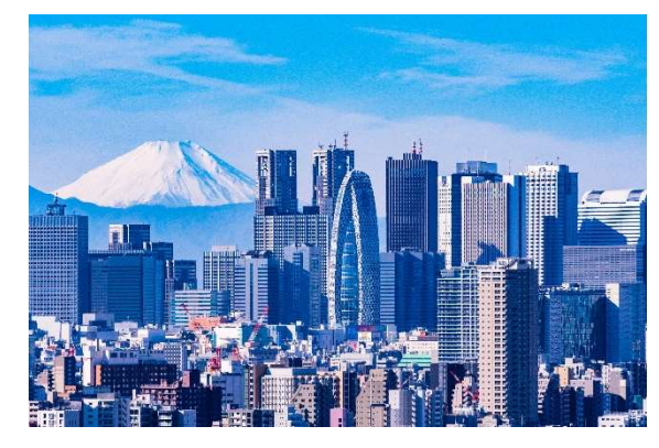
Skyscrapers in Tokyo and Mt. Fuji (2020)

Office for JICA Development Studies Program