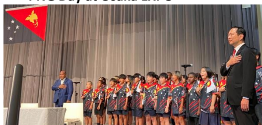
Six students and a teacher from Sogeri Primary