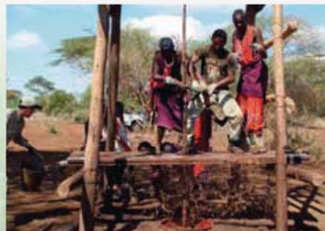
International Water Project (IWP) " Small-scale water supply system in Loitokitok District, Kenya"

IWP is transferring Kazusabori which is traditional Japanese technology of well-digging to local people in Kenya and they construct wells, ponds and trough for livestock in order to access clean and safe water.