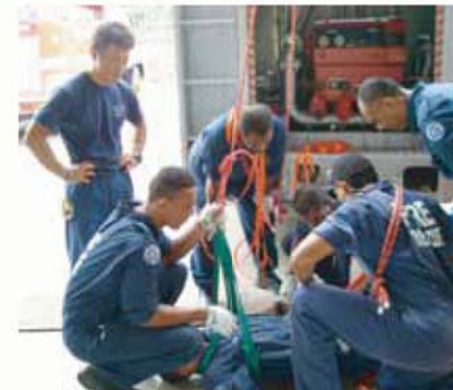
Matsusaka Area Firefighting Association "Water Rescue Training, Fiji"