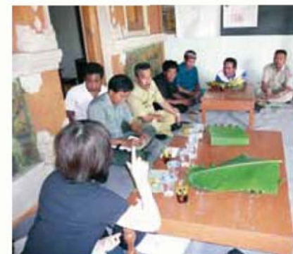
i-i-net "Creation of co-existent and collaborative relationship between local communities and Bali Barat National Park for conservation and management of natural resources and community empowerment, Indonesia"

Expense for JICA Partnership Program is a part of ODA, and JICA entrusts the project to the proposing organization as a part of ODA.