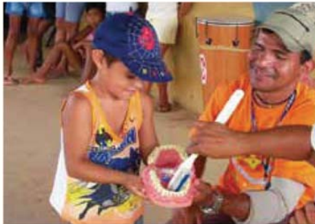
HANDS(Health and Development Service)The Project for Improvement of Children's Health Consciousness by Activating Local Organizations in Western Amazon, Brazil"

The aim of this project is to improve community health condition in the Amazon River region through community Health worker's ability improvement, resident's nutritional modification and the hygiene knowledge improvement.