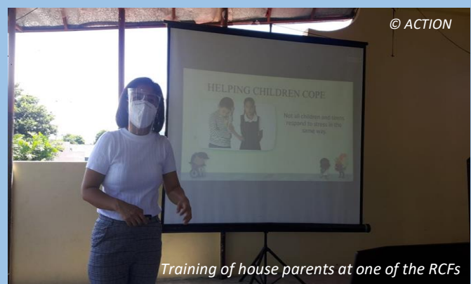
Training of house parents at one of the RCFs