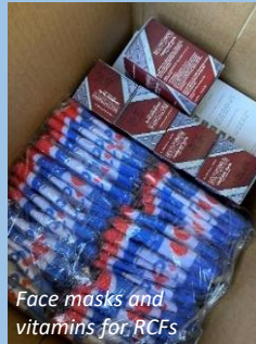
Face masks and vitamins for RCFs

JICA in partnership with Japanese non-profit organization A Child's Trust is Ours to Nurture (ACTION) distributed hygiene kits to benefit almost 2,000 children and personnel in Residential Care Facilities (RCFs) in Central Luzon (Region III) and National Capital Region. The hygiene kits included thermometers, alcohol, bath soap, multivitamins, washable masks, and disinfectants. The project also included capacity building of house parents as well as social workers on hygiene and sanitation management as well as stress and anxiety management to boost frontline RCFs in continuing their services to vulnerable children during these difficult times from the pandemic. •