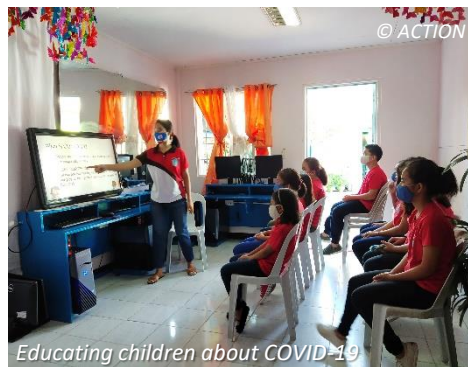
Educating children about COVID-19

Training launched to promote stress and anxiety management to benefit Filipino children in residential care facilities