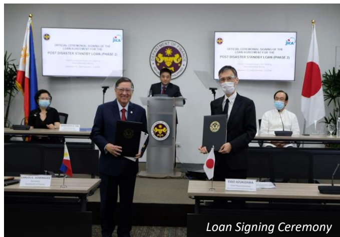
Loan Signing Ceremony