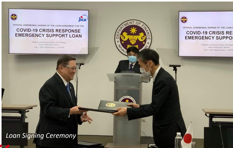
Loan Signing Ceremony

“JICA stands with the Filipinos in this time of Bayanihan... We will continue to explore new and innovative ways to deliver our development cooperation program in response to the Philippines' immediate needs and consistent with our mandate to promote inclusive and sustainable growth and a better quality of life for all.