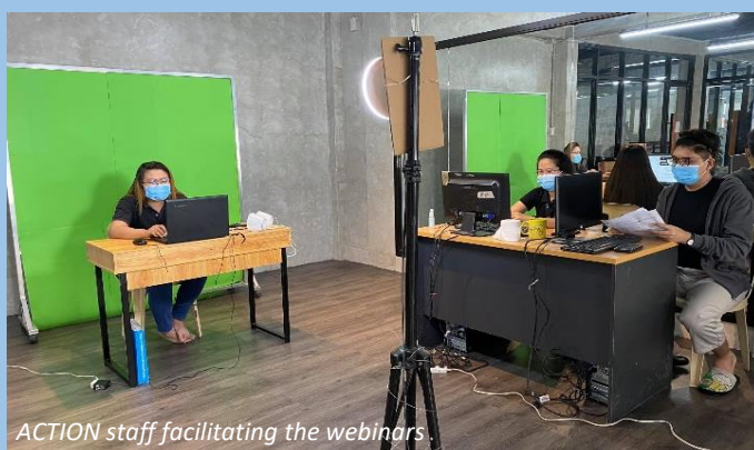
ACTION staff facilitating the webinars