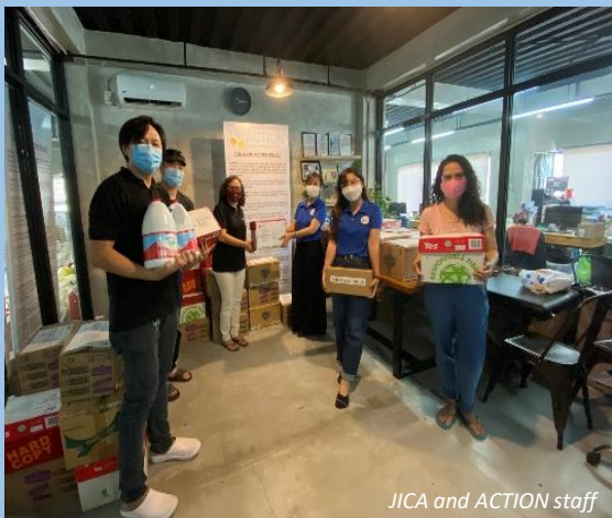
JICA and ACTION staff