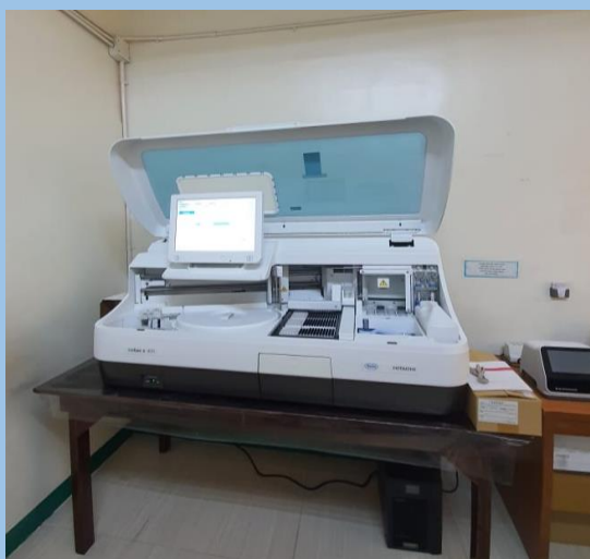
Cobas e 411 analyzer for immunoassay tests

JICA expressed confidence that through international cooperation, the global community will overcome the current challenge. •