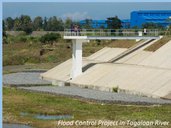
Flood Control Project in Tagoloan River

As typhoon season sets in the Philippines again, the Department of Public Works and Highways (DPWH) said the completed flood risk management project in Tagoloan River is an important project that can help mitigate flooding in the area. More than 1,000 households along the river banks are at risk during strong typhoons. Hence, under the project, a dike was built at the upstream part of the river while sluiceway and drainage canals were constructed using Japanese technology to prevent water overflow and drain rainwater into the river. Aside from flood control structures, JICA and DPWH also implement non-structural measures (e.g. disaster awareness, drills, hazard maps) under the project to mitigate flood disasters. •