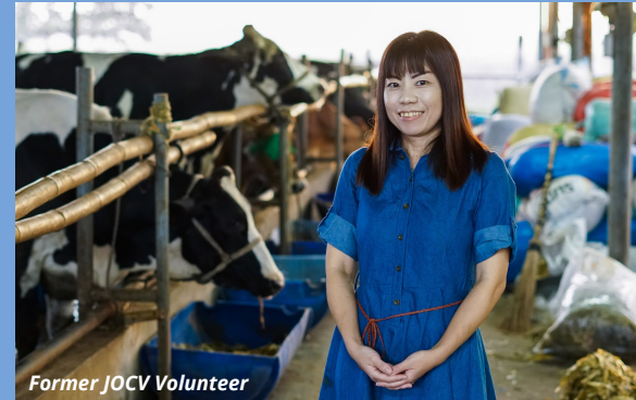
Former JOCV Volunteer