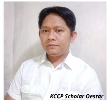
KCCP Scholar Oestar

JICA's KCCP aims to share Japan's knowledge and skills as well as the Japanese model in establishing systems and structures. It is usually held in Japan in partnership with Japanese organizations and academic institutions, but due to the pandemic, current courses are being held online. The courses usually run from a few days to weeks, to as long as one year for the master's degree courses.