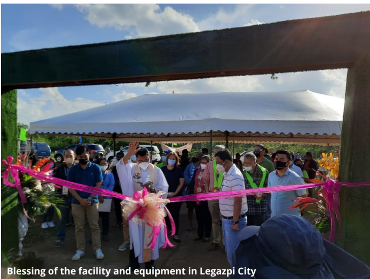
Blessing of the facility and equipment in Legazpi City