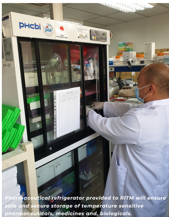
Pharmaceutical refrigerator provided to RITM will ensure safe and secure storage of temperature sensitive pharmaceuticals, medicines and, biologicals.

As countries pose restrictions once more due to the continuous spread of COVID-19, JICA exerts efforts to help the Philippines cope with the pandemic in a sustainable way. Here's a roundup of JICA's latest cooperation with the Philippines to support build back better from COVID-19.