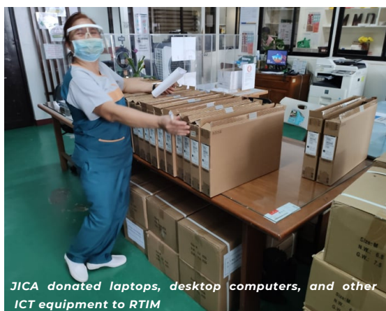
JICA donated laptops, desktop computers, and other ICT equipment to RITM

JICA is working in tandem with health institutions to enhance disease surveillance in the Philippines and curb rising COVID-19 cases. A technical cooperation project is currently being formulated with the Department of Health (DOH) to strengthen the Philippines' laboratory network's capacity on disease management and biosafety. They will develop a roadmap as well as manuals and training modules to boost disease response.