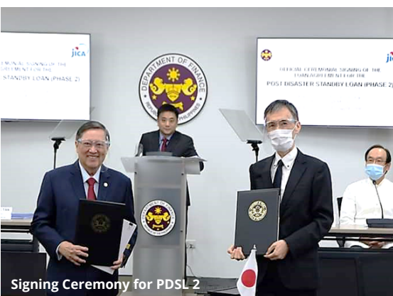
Signing Ceremony for PDSL 2

JICA also provided recently new laptops, desktops, and other information and communications technology (ICT) to the Research Institute for Tropical Medicine (RITM). These aim to help improve data management and telemedicine for COVID-19 in the Philippines. Earlier, JICA has also provided laboratory equipment to its partner health institutions for COVID-19 testing, and storage of sensitive medicine and pharmaceutical supplies, as well as automated immunoassay analyzer of test results.