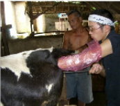
Japan Overseas Cooperation Volunteers (JOCV)