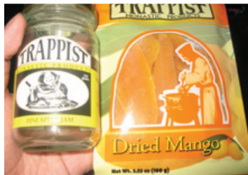
Cover Design by DOST Packaging Research & Development Center

The strategy likewise strengthens our partnership with international organizations and other donor institutions, private sectors, academe and nongovernmental organizations.