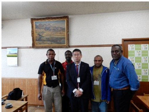
Courtesy visit Saitama prefecture office

They learnt general of local administration office's work, technical knowledge of civil work and also conservation of natural environment.