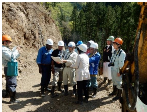
Construction Site visit in Hanno city and Chichibu city