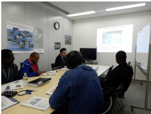
Gravel road maintenance

At the classroom lecture they learnt the basic of gravel road maintenance and safety management from experienced trainers.