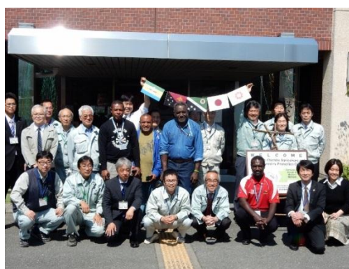
Chichibu agricultural and forestation office