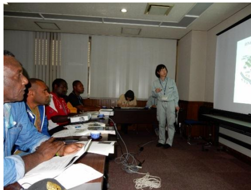
Classroom lecture by Forestation Division