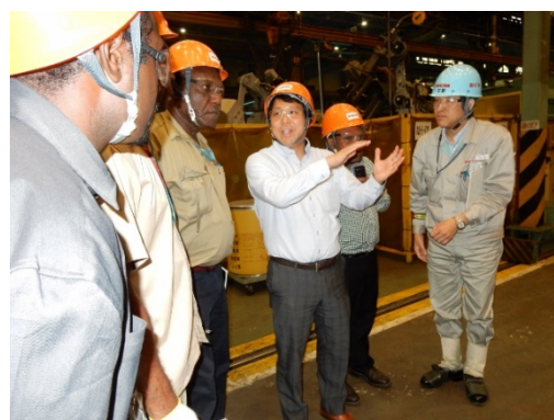
KCM (Kawasaki Construction Machinery Corp)