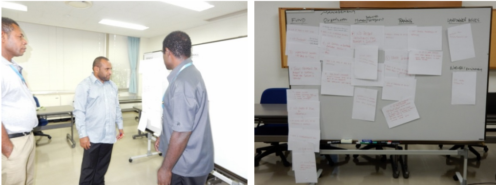
Discussion about issues of DoW

At the end of the two weeks training, the trainees summarized the training in the presentation document after discussion regarding the issues and problem of DoW and what we learnt in Japan. They expressed their idea what they learnt and felt in Japan with heartfelt thanks to relevant people and organization of this counterpart training.