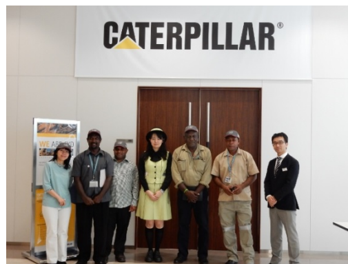
Caterpillar Japan Ltd.