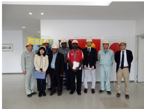
Sakai Heavy Industry, LTD.