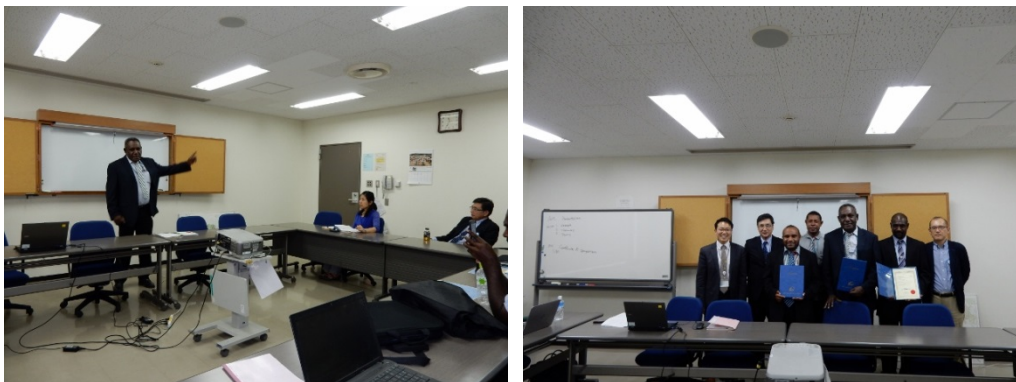
Presentation by trainees